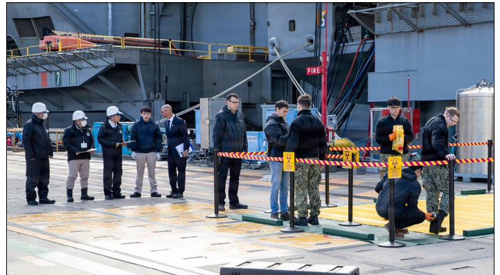
Japanese Nuclear Regulation Authority and U.S. Navy participants simulate radiological surveys on the pier during the U.S.-Japan Joint Drill at Commander, Fleet Activities Yokosuka, Dec. 18, 2025. The surveys are shared with each other and confirm no radiological impact to the base and environment from the simulated event. The drill, led by Commander, Submarine Group Seven, simulates a medical emergency aboard the nuclear-powered aircraft carrier USS George Washington (CVN 73), emphasizing the precedence medical treatment holds in a joint response. Now in its 18th iteration, this U.S.-Japan Joint Drill demonstrates the integral coordination and cooperation between the U.S. Navy, Government of Japan, and City of Yokosuka that further supports the alliance between our two nations.

and Japan utilize their combined trainings and lessons learned, refining the operational effective and further aligning the allies' mutual interest towards the safety and security of the region and its communities.