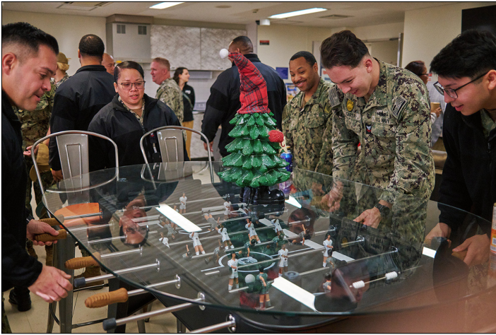
More than 40 Sailors and staff attended a ribbon-cutting ceremony at the Commander, Fleet Activities Yokosuka (CFAY) Morale, Welfare, and Recreation (MWR) Satellite Liberty Center located in Unaccompanied Housing Building 3337 Wednesday, Dec. 10, 2025.

make the kitchen area feel more like a kitchen that you'd find in the States." CFAY MWR Liberty, alongside other Navy MWR Liberty Centers throughout Japan, has also partnered with The New Sanno in Tokyo offering discounted rooms on Fridays and Saturdays to eligible Sailors.