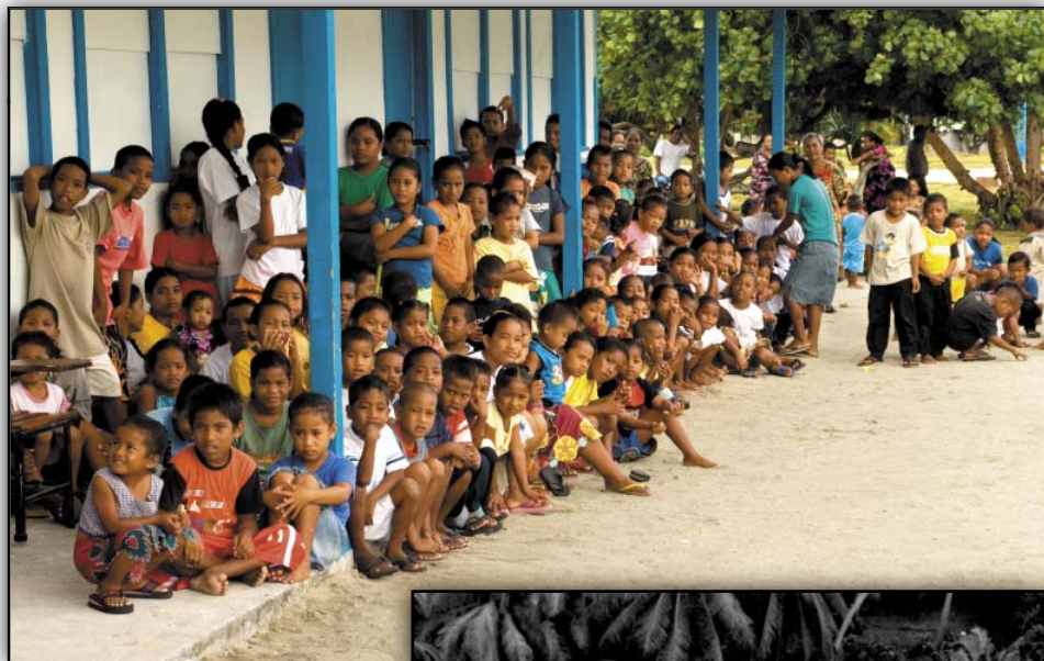
Above, Children on Ebaddon anxiously await the arrival of the Yokwe Yuk Women's Club Christmas Drop. Right, A helicopter bearing gifts for outer island children flies over a greeting from residents of Ebaddon.