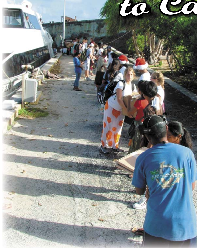
Marshall Islands Club members unload supplies and gifts on Carlos for the annual Christmas celebration.