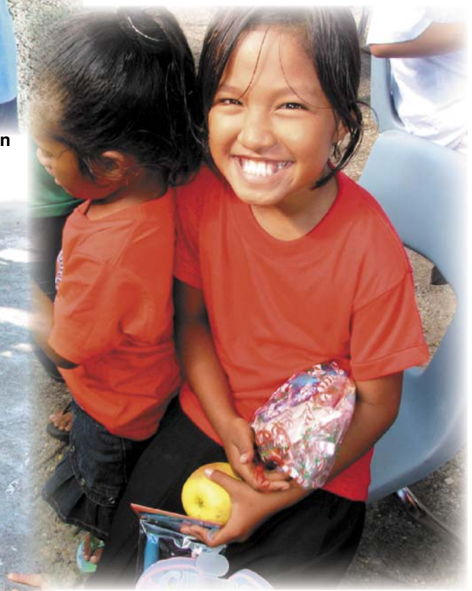
A young Carlos resident enjoys her gifts and fruit that were given out as part of the annual trip to Carlos.