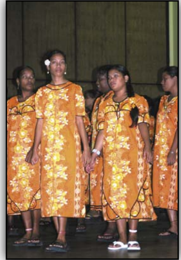
Members of the Lib Island Jebta dance at the Annual Christmas in the Marshall Islands celebration Monday evening in Corlett Recreation Center gym. The event is sponsored by the Marshallese Cultural Center.

Kwajalein community members are invited to celebrate Christmas with our Marshallese neighbors. The jebtas performances begin around noon on Christmas day at the Protestant Church, Calvary Church and Bukot non Jesus on Ebeye. This Christmas tradition is an all day affair; be sure to bring water and a fan.