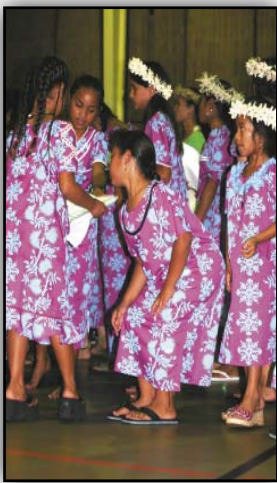
Children of the Kwajalein Jebta perform a dance at the celebration Monday evening.