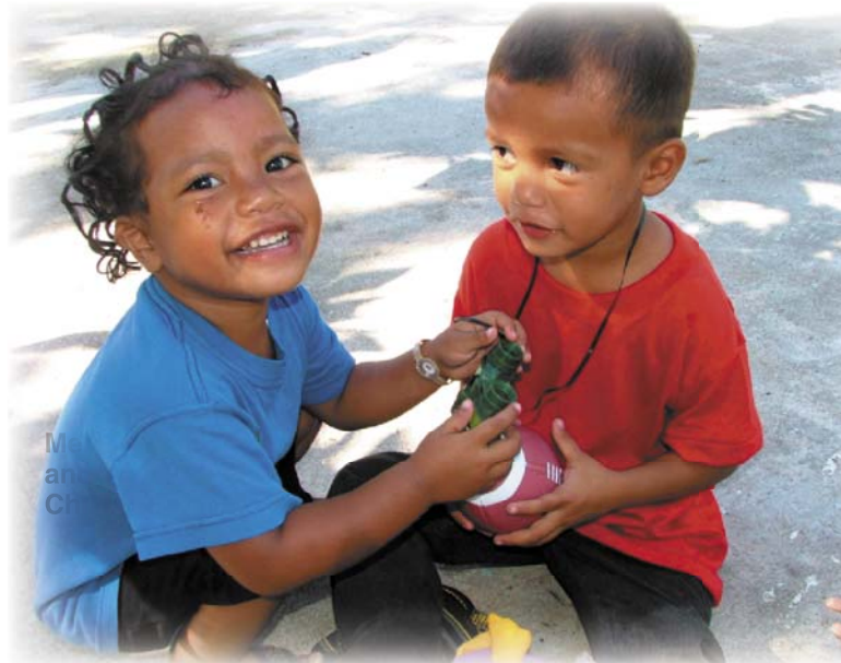
Two youngsters check out the toys they got from the Marshall Islands Club.