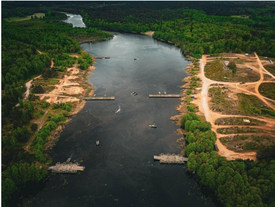
Figure 5: Overhead view of the Crossing Sites at the Drawsko Pomorski Combat Training Center. The 44rd MRBC has two rafts and the 23rd AMPH has two M3 Rigs in preparation for rafting or ferrying operations. Photo taken by MAJ Rafal Kazmierczyk, 11 May 2024 5 .

headquarters to ensure that these events are programmed and executed across the multi-national, multi-component enterprise. Those risk reduction events must also address tactical communications as the movement and distribution of communications security (COMSEC) in a semi-permanent setting is full of complexity and challenge. There are a range of solutions that exist to these networking and communications issues – but they all require disciplined and deliberate planning and execution to get right.