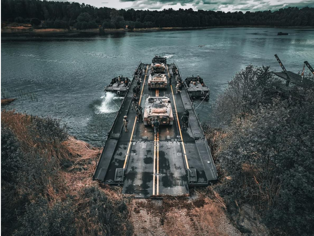
Figure 4: The 43d Multi-Role Bridge Company “Gators” conduct longitudinal rafting operations with the 7th Polish Coastal Brigade at the Drawsko Pomorski Combat Training Center. Photo taken by MAJ Rafal Kazmierczyk, 11 May 2024 4 .

Language differences can be a significant challenge in multinational military operations. Miscommunication due to language barriers can lead to operational failures, delays, or even dangerous misunderstandings. Even speaking the same language can lead to misunderstanding due to common military phrases that differ between partners. For example, an engineer equipment park (EEP) in U.S. Army terminology is the same thing as a Zulu Muster in British Army language. There are also differences in tactical task definitions, standard procedures, and equipment capabilities that all need to be deliberately clarified. Rehearsals at echelon mitigated this risk by allowing forces to practice communication protocols in a controlled environment. They also provided an opportunity for interpreters and liaison officers to refine their roles and ensure that key messages are accurately conveyed. Over time, we saw these rehearsals help build a shared vocabulary and understanding, reducing the likelihood of language-related issues during the actual mission.