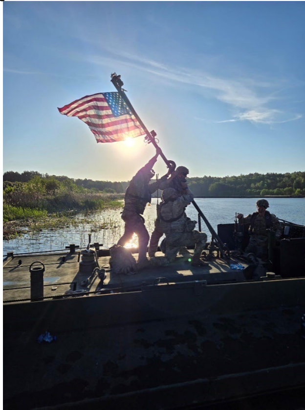
Figure 7: Soldiers from the 43d Multi-role Brigade Company raise the US colors on a bridge erection boat during gap crossing operations. The pride and spirit of each nation participating in Defender Europe was on display throughout the exercise and it certainly enriched the event.

units need to ensure they recognize these events for what they are and look to create separate opportunities to challenge their formations at echelon.