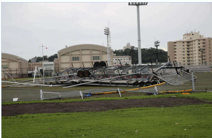
Bleachers from Commander, Fleet Activities Yokosuka's (CFAY) Berkey Field are turned upside down by Typhoon Faxai, a storm with winds of more than 124 miles per hour that made landfall over CFAY.

The link is available here: https://cnrj.cnmc.navy.mil/Installations/CFA-Yokosuka/Operations-and-Management/Emergency-Management/Tropical-Cyclone-Condition-of-Readiness/ .