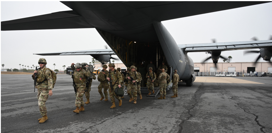
Texas Army National Guard Soldiers with the 72nd Infantry Brigade Combat Team and 71st Troop Command exit a Texas Air National Guard C-130J Super Hercules in McAllen, Texas Jan. 27. Aircrews with the 136th Airlift Wing, TXANG, transported nearly 200 troops down to the southern border in support of Operation Lone Star.

The secretary of defense has directed the National Guard Bureau to provide immediate support for presidential executive orders on protecting the territorial integrity of the United States. In support of U.S. Northern Command, the Department of Defense’s operational lead, the National Guard is “Always Ready, Always There” and is urgently working to fully accomplish the objectives of the presidential executive orders.