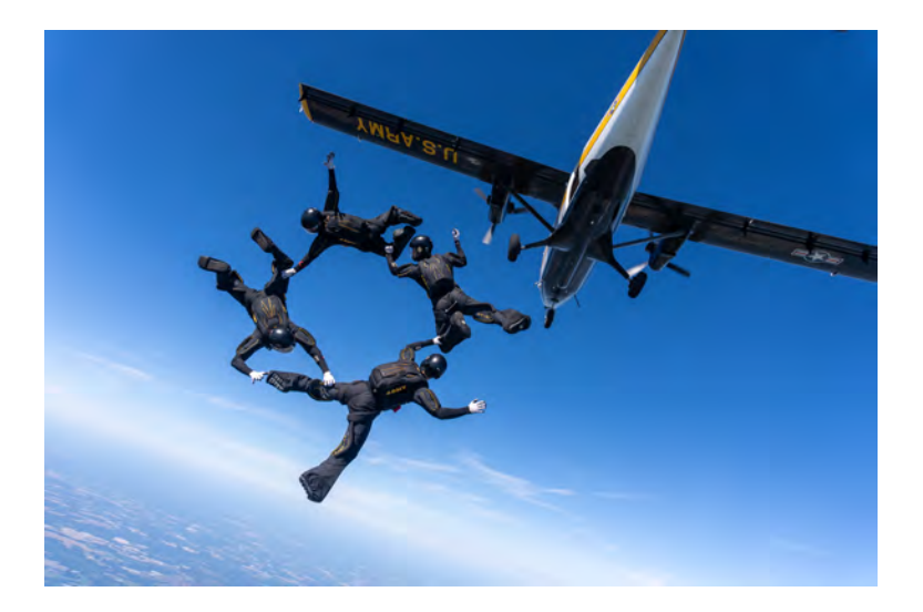
The 4-way formation competition teams exits a Twin Otter for a training jump over Laurinburg, N.C.