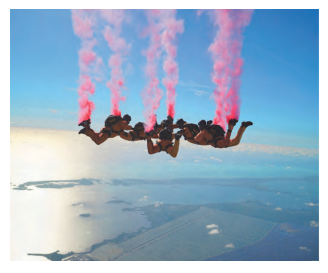
Members of the United States Army Parchute Team display a mass formation during winter training.

** For additional information on specific maneuvers that will be performed for the 2025 demonstration season and beyond, see below Supplementary Information**