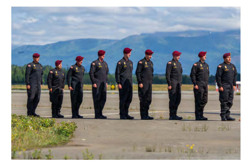
The Gold Demonstration Team stands in formation at Joint Base Elmendorf- Richardson, Alaska.