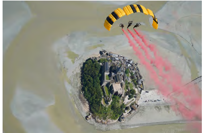
The Golden Knights perform a demonstration over Mont Saint-Michel for the 80th anniversary of D-Day.

Located on Fort Bragg, NC, the front half of the Golden Knight Headquarters houses the team museum which is a monument to the competition team's accomplishments. The team is revered not only for its fierce reputation, but also its spirit of camaraderie and sportsmanship; the team has competed in disciplines such as canopy piloting, canopy relative work, free-fall formation skydiving, target accuracy, and vertical formation skydiving. They also sport an impressive record of over 490 national champion, 130 world champion, 50 national, and 10 world team titles.