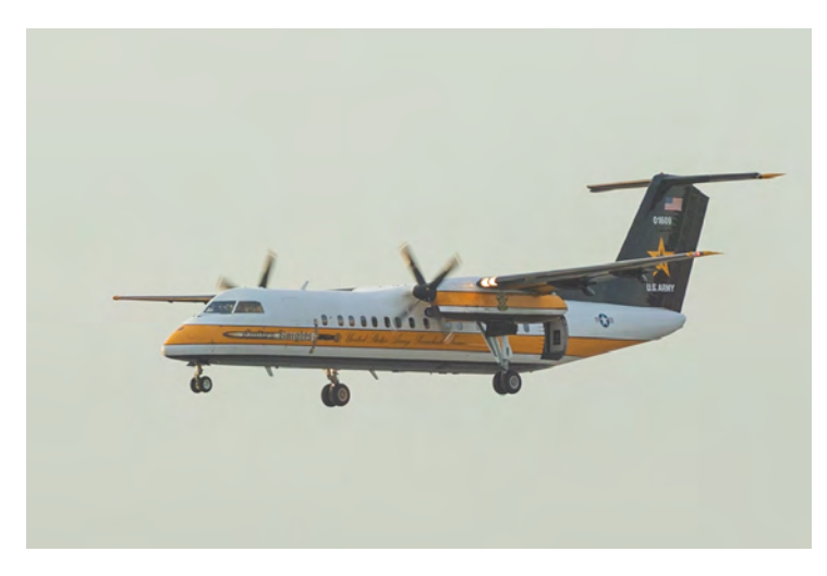
Here the team proudly displays their newest member of the fleet, the C-147A (DHC-8 315).

The aviation detachment, known as "Team Six," is the backbone of the parachute team and is composed of some of the finest fixed-wing aviators and crew members in the Army. These officers, warrant officers, Soldiers, and Department of the Army Civilians ensure all teams arrive safely to their destinations anywhere in the country and land on target in plus or minus 30 seconds. The aviation detachment has flown more than 114,000 hours under the most demanding weather, time constraints, and air traffic conditions. The pilots and crew members maintain a fleet of five aircraft: Two DHC-8 / C-147A medium transport aircraft specially modified for paradrop operations, and three DHC-6-400 Twin Otters, also known within the Army as the UV-18. No other section tops Team Six's professionalism, experience, and make-it-happen attitude.