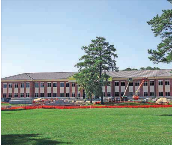
LANCE CPL. CORY D. POLOM

The new building replaces the one that burned in a 2007 fire. It will house the commands of Marine Corps Air Station Cherry Point and the 2nd Marine Aircraft Wing, and is tentatively scheduled to open in January.