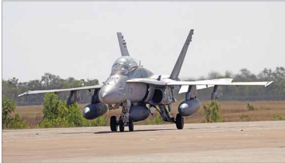
A Marine All-Weather Fighter Attack Squadron 224 F/A-18 Hornet lands for Exercise Southern Frontier at Royal Australian Air Force Base Tindal, Australia, Aug. 31. Southern Frontier is an annual, bilateral training exercise hosted by the Royal Australian Air Force allowing the squadron to focus on offensive air support training in order to improve squadron readiness.

"Flying definitely puts hours toward the life of the aircraft," said Dean. "When we move the jets, we have to bring all of our maintenance support. No matter where we are, the jets still require periodic inspec-