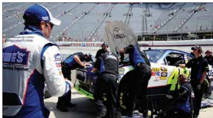
Jimmie Johnson (left) looks on as crew members work on the No. 48 Lowe's Chevrolet during practice for August's IRWIN Tools Night Race at Bristol Motor Speedway.

"Most of that starts to show itself four or five races into the Chase, and that's kind of the way I feel about it right now," he said. "Yeah, maybe there's no clear-cut favorite right now, the way the past 26 races have gone. But I've seen how the team that really is going to go win this championship seems to be pretty clear ... four or five races into the Chase, and I wouldn't be surprised if that happens again this year."