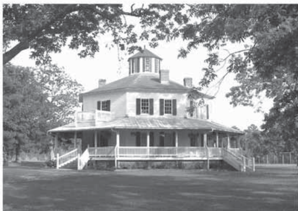
The Historic Octagon House, circa 1856