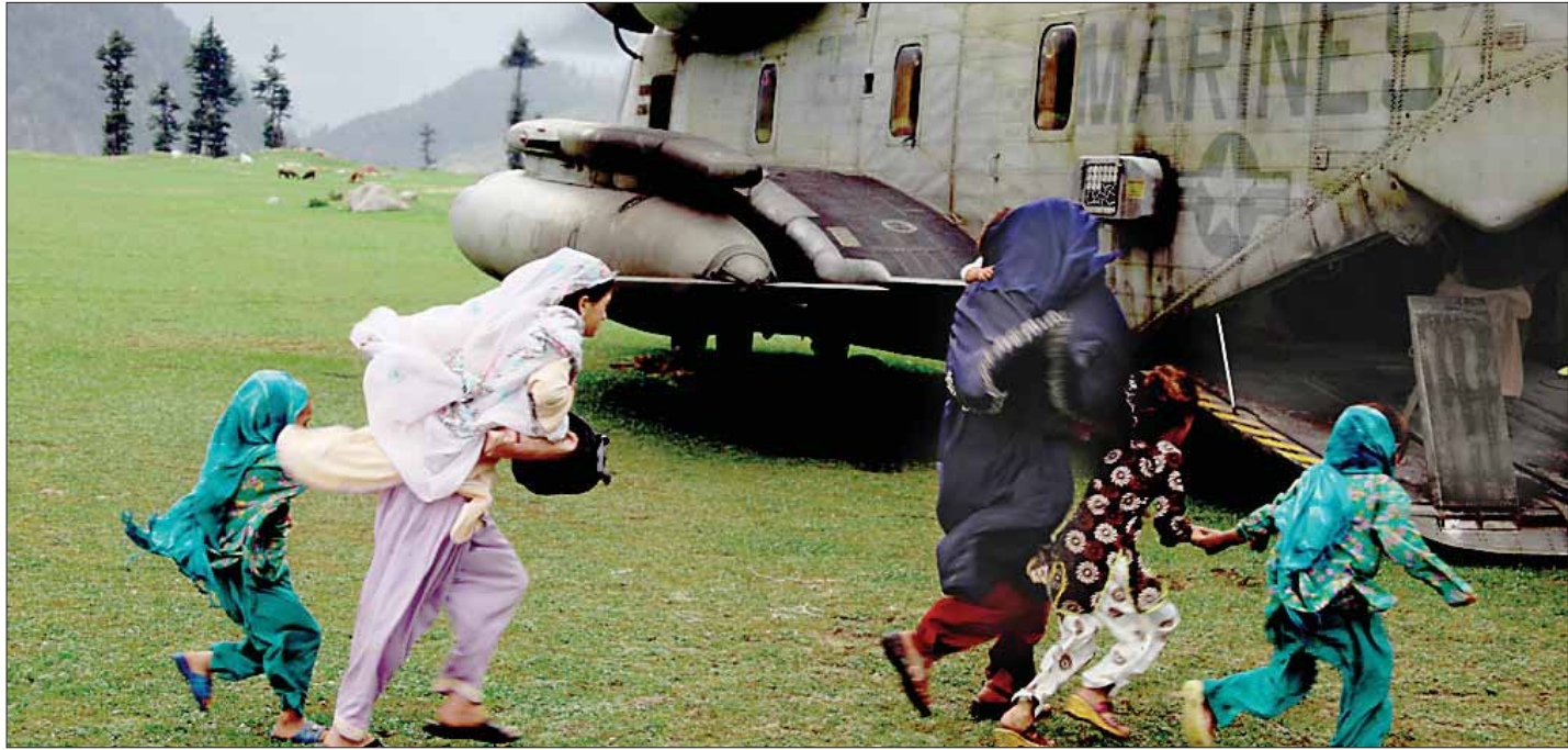
Pakistani women and children board a CH-53E Super Stallion from Marine Medium Helicopter Squadron 165, serving with the 15th Marine Expeditionary Unit during humanitarian relief efforts in the Khyber-Pakhtunkhwa Province of Pakistan Aug. 17.