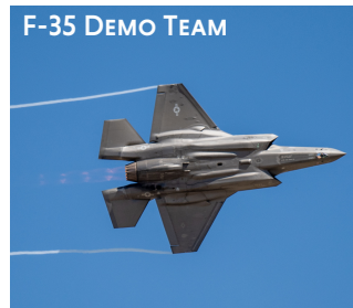
F-35 DEMO TEAM