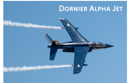
DORNIER ALPHA JET