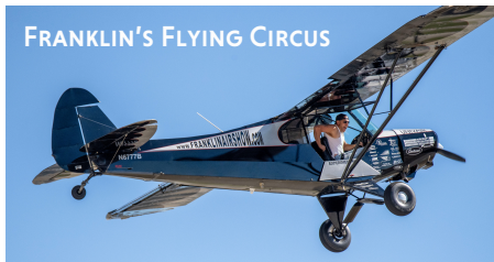
FRANKLIN'S FLYING CIRCUS