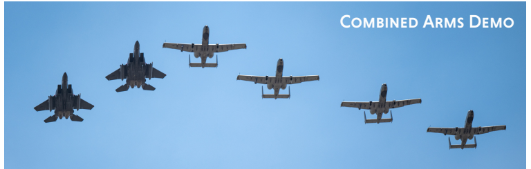
COMBINED ARMS DEMO