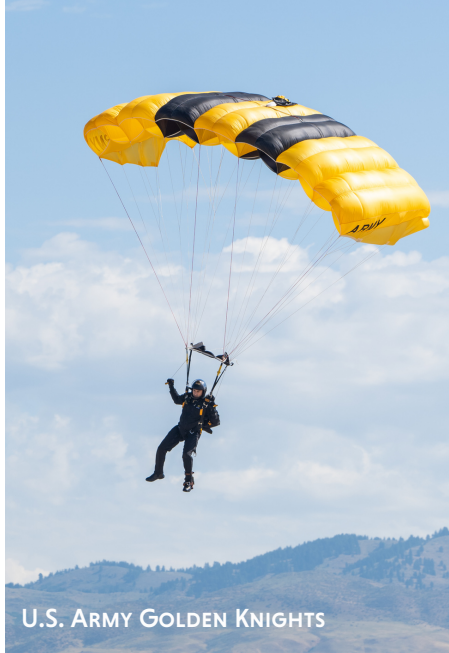
U.S. ARMY GOLDEN KNIGHTS