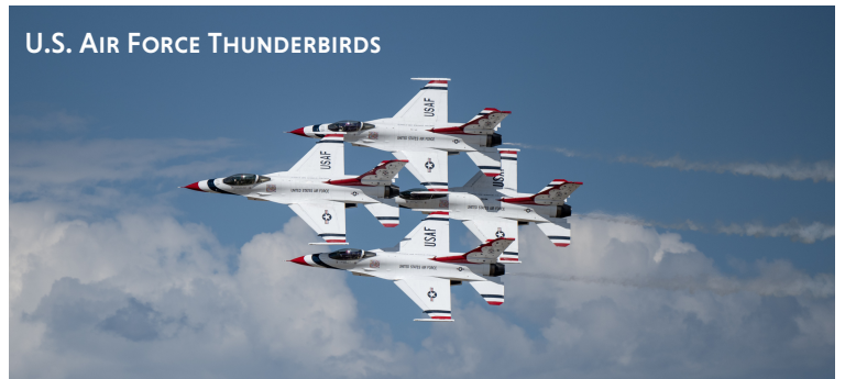
U.S. AIR FORCE THUNDERBIRDS