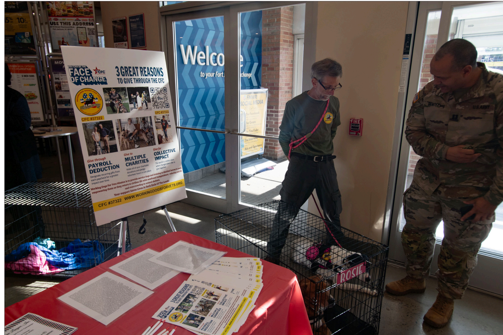
A Soldier meets face-to-face with a local charity during a Combined Federal Campaign charity fair held Jan. 10 at the Exchange. The CFC is an annual campaign where charities can solicit donations from federal employees. For those looking to donate should visit GiveCFC.org .

"The devastation of multiple natural disasters