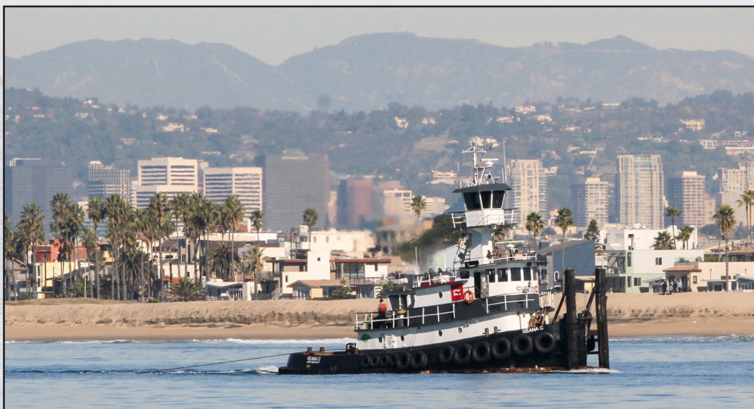
The Seanna C, a triple-screw-model bow tug, makes its way from Marina del Rey Harbor, California, while pulling a dump scow, called the Robert L, to a nearshore area of Dockweiler State Beach in nearby Playa del Rey. The vessels are slated to make four to five trips per day for the next five months to complete this cycle of maintenance dredging for the entrance channel of Marina del Rey Harbor.