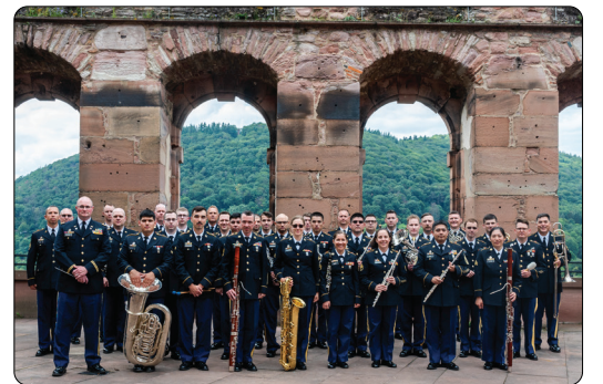
The Oregon Army National Guard’s 234th Army Band gather for a group photo after a concert at Heidelberg Castle in Germany, July 30, 2023.

To help battle against the threats of illicit drugs and the damage associated with the well-being of our communities, the Oregon National Guard helps “bridge the gaps” between the Department of Defense and federal, state, and local agencies across a full range of counterdrug operations. The Counter Drug Program provides direct support to law enforcement agencies, as well as community organizations – in turn, helping disrupt and deter drug production and drug trafficking in the state and other regions.