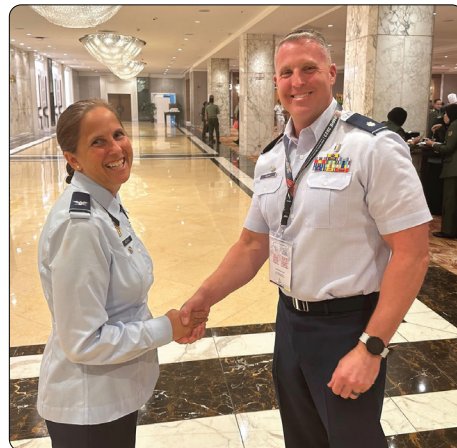
ORANG Lt. Col. Christopher Webb receives a 'Challenge Coin' from PACAF HQ Command Surgeon Col. Susan Moran at the Indo-Pacific Military Health Exchange 2023 conference in Kuala Lumpur, Malaysia, Sept. 26, 2023.

While attending the Indo-Pacific Military Health Exchange Conference held in Malaysia from September 26-29, 2023, Webb was