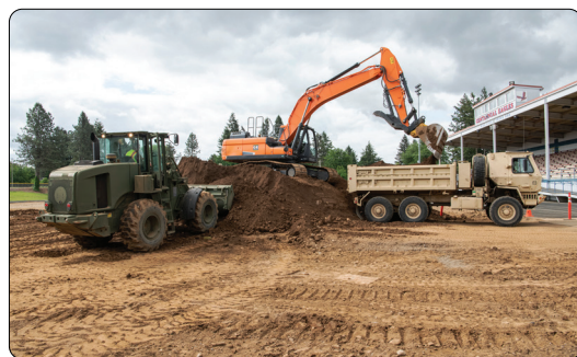
ORARNG Soldiers assigned to the 1249th Engineer Battalion work to relocate over 8,500 cubic yards of soil, rocks and from the Centennial High School football field on May 23, 2023 during their two-weeks of IRT.

The Enduring Partners 2023 engagement was aimed at improving combat readiness and combined operations between participants while enhancing