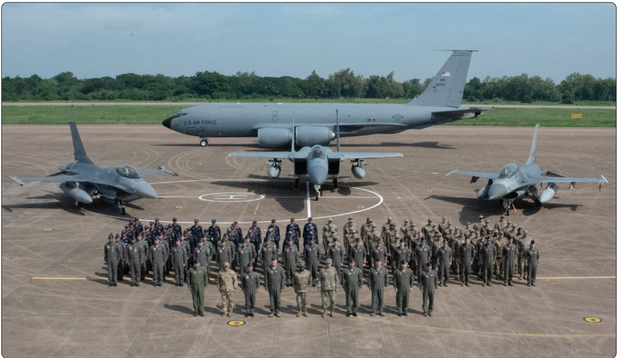
Military service members from the Washington and Oregon Air National Guard stand alongside the Royal Thai Air Force members on Korat Air Base, Royal Kingdom of Thailand during the closing ceremony for the Enduring Partners engagement 2023, September 21, 2023. The Washington and Oregon ANG members spent two weeks collaborating and building a stronger relationship with the Royal Thai Air Force as part of the State Partnership Program.

"This is by far one of the coolest things I have been able to do in the military," he said. "Those kids really wore me down."