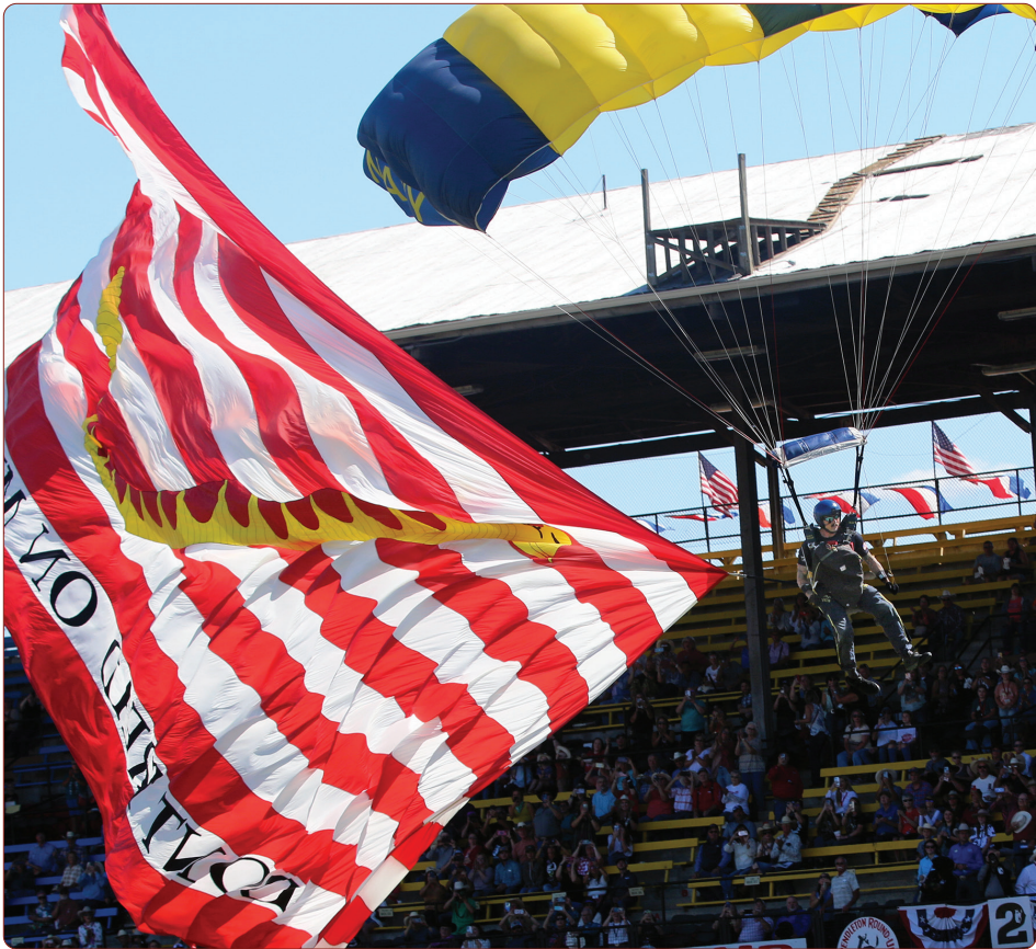
The 2023 Pendleton Round-Up Rodeo in eastern Oregon witnessed a remarkable display of precision and patriotism as the Pendleton community celebrated another successful event. At this iconic gathering, Pendleton’s 1st Battalion, 168th Aviation Regiment of the Oregon Army National Guard joined forces with the renowned Navy Leap Frogs, treating rodeo enthusiasts to an unforgettable performance.