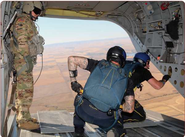
U.S. Navy Leap Frogs prepare to descend from an ORARNG CH-47 Chinook Helicopter, earning thunderous applause from the ecstatic crowd at the Pendleton Round-up on Sept. 14, 2023.

The U.S. Navy Parachute Team, known as the Leap Frogs, traces its roots back to 1969 when Navy SEALs and Underwater Demolition Team members volunteered for weekend air shows. In 1974, they officially became the Leap Frogs with a mission to showcase Navy