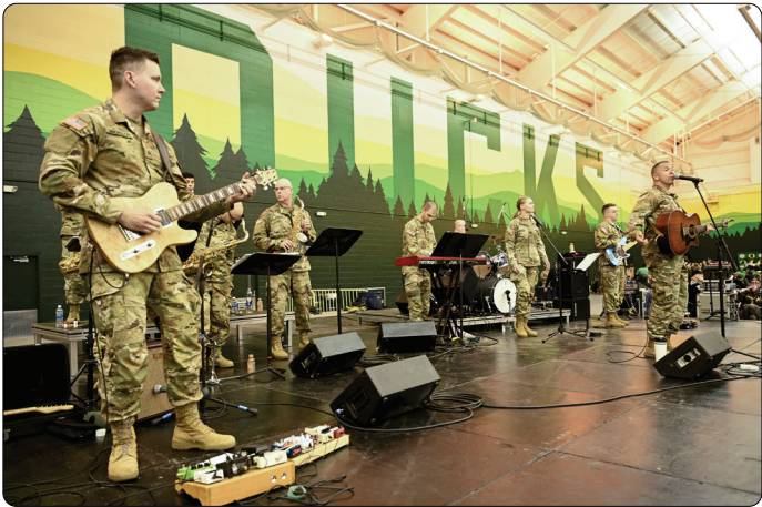
The Oregon Army National Guard 234th Army Band perform at the Moshofsky Center at the University of Oregon, Eugene, Oregon, on Nov. 11, 2023. The '45 Away' rock and pop group played a pre-game performance for those attending the University of Oregon football game on Veterans Day.

The Oregon National Guard provides rare opportunities to serve the local community during emergencies while training for missions around the world. Members enjoy benefits like education and career skills training. Most importantly, the Guard fosters a spirit of service above self, commemorating past sacrifices while continuing to serve today.