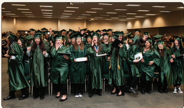
Cadets of Oregon Youth Challenge Program (OYCP) class 66 cheer in celebration at the completion of their graduation ceremony, held at the Deschutes County Fairgrounds, Redmond, Oregon. OYCP is Oregon's only accredited statewide alternative high school and aims to provide opportunities for personal growth, self-improvement and academic achievement among Oregon high school dropouts, teens no longer attending and those failing in school, through a highly structured non-traditional environment.