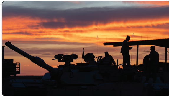
A 3rd Battalion, 116th Cavalry Regiment M1A2 SEPv2 Abrams crew prepares their tank for the night portion of Table VI Gunnery Qualification at Orchard Combat Training Center, near Boise, Idaho, July 23, 2023.

The National Guard’s State Partnership Program celebrated its 30th anniversary in 2023, which began after the breakup of the Soviet Union. It is now paired with over 100 nations with Soldiers and Airmen from every state and U.S.