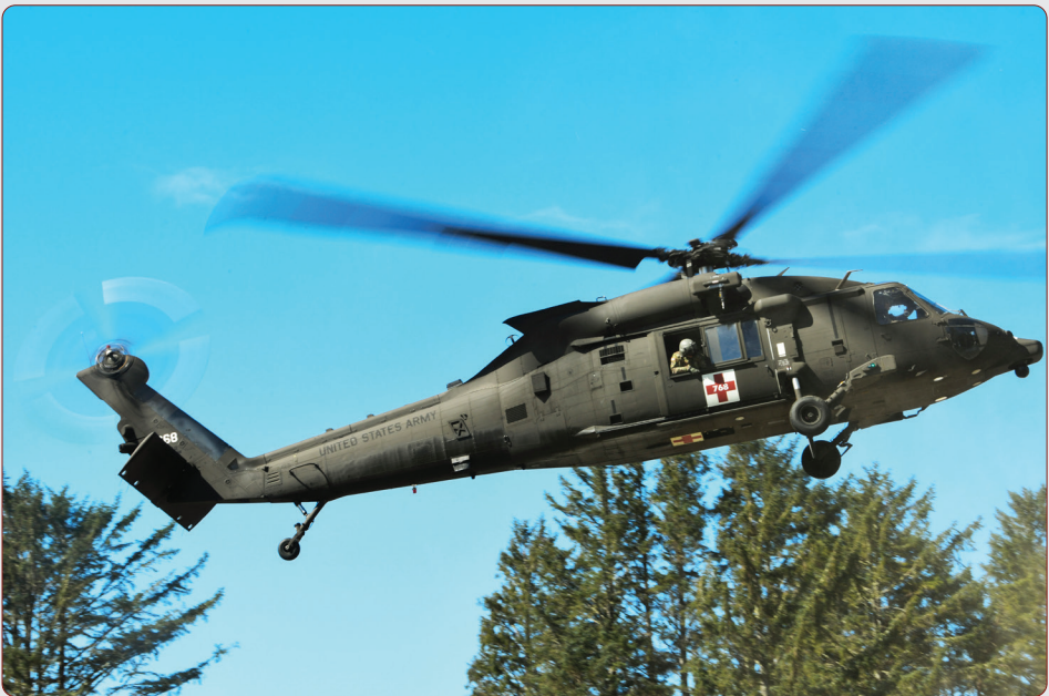
FILE PHOTO: An Oregon Army National Guard HH-60M Black Hawk helicopter takes off from a landing zone during the 2022 Best Warrior Competition, March 19, 2022 at Camp Rilea near Warrenton, Oregon. Members of the ORARNG conducted two SAR missions using the HH-60 Black Hawk on Oct. 26, 2023 near Mt. Jefferson, saving two stranded hikers.

The Marion County Sheriff’s Office received a notification from the father of a missing male Australian mountain biker, routed through the consulate in Sydney, Australia, and stated that his son had texted him from Oregon and was stranded without cold weather gear. The mountain biker was stuck in a four to five-foot snowdrift along a trail near Hawk Mountain, Oregon.