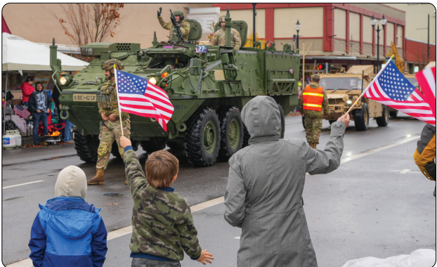
Attendees wave at Oregon National Guard members and other entrants during the Linn County Veterans Day Parade held in Albany, Oregon on Nov. 11, 2023.