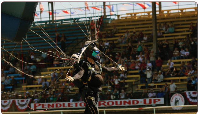
A U.S. Navy Leap Frog members lands to the applause from those attending the Pendleton Round-up on Sept. 14, 2023.