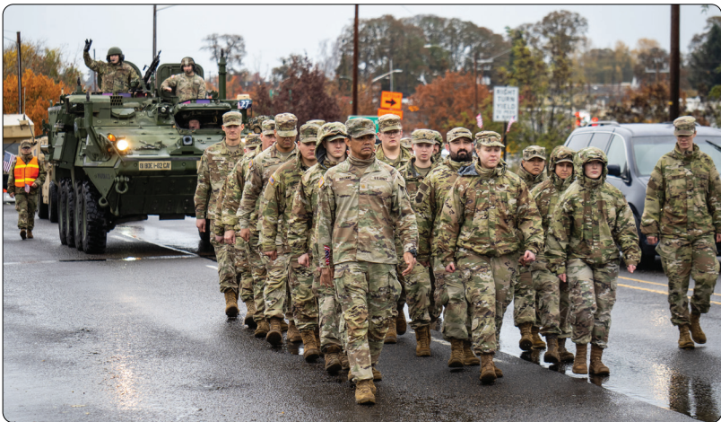
Linn County Veterans Day parade Oregon National Guard troops marching comprised of Air and Army National Guard members during the Linn County Veterans Day Parade on Nov. 11, 2023, in Albany, Oregon.