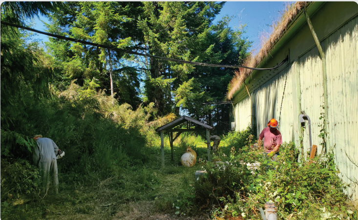
Members of the 173rd Civil Engineering Flight work to clear nearly 40 years of vegetation from an Area Defense Command site near North Bend, Oregon in late summer 2023.

While Team Kingsley CE has only five specific career fields to pull from, most Airmen in the Flight are prior-service members and engineering professionals in their community. This on-site team represented over 16 different Air Force skill sets and a tremendous amount of additional civilian career disciplines. This team illustrated what the term Multi-Capable Airman means.