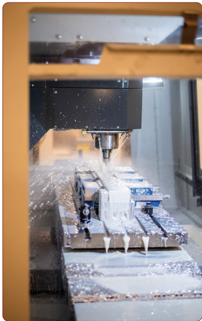
A Computer Numerical Control Mill housed within the 142nd Wing's fabrication flight shop cuts metal into an essential part for the F-15C Eagle.