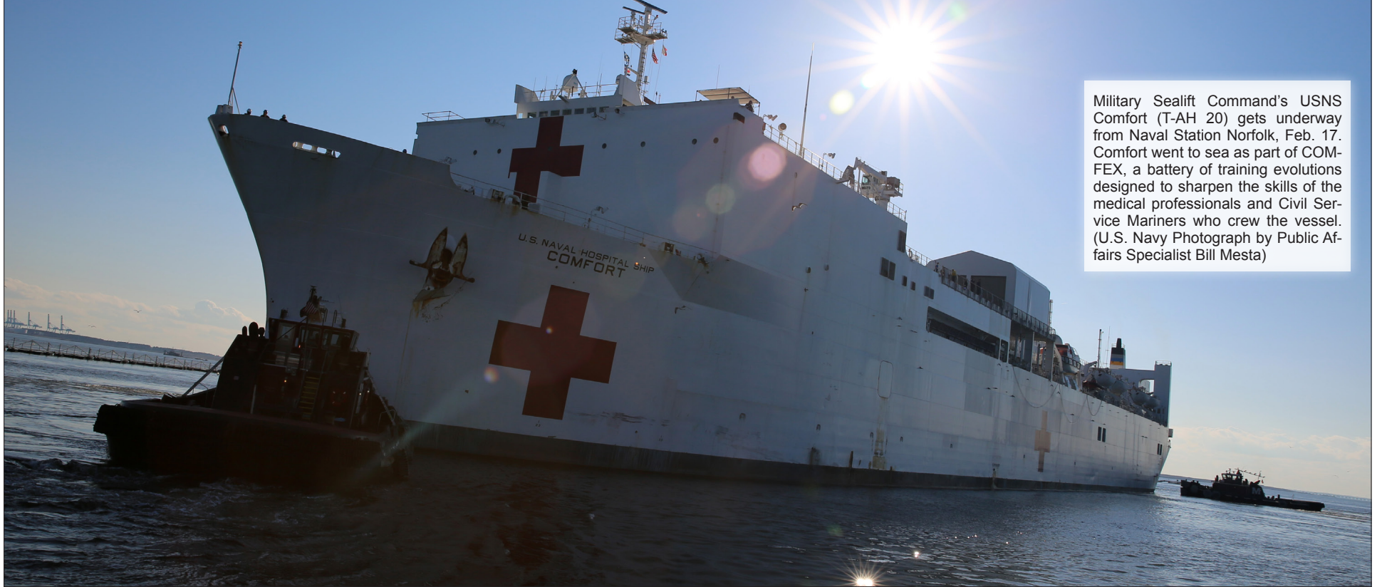
Military Sealift Command's USNS Comfort (T-AH 20) gets underway from Naval Station Norfolk, Feb. 17. Comfort went to sea as part of COMFEX, a battery of training evolutions designed to sharpen the skills of the medical professionals and Civil Service Mariners who crew the vessel.