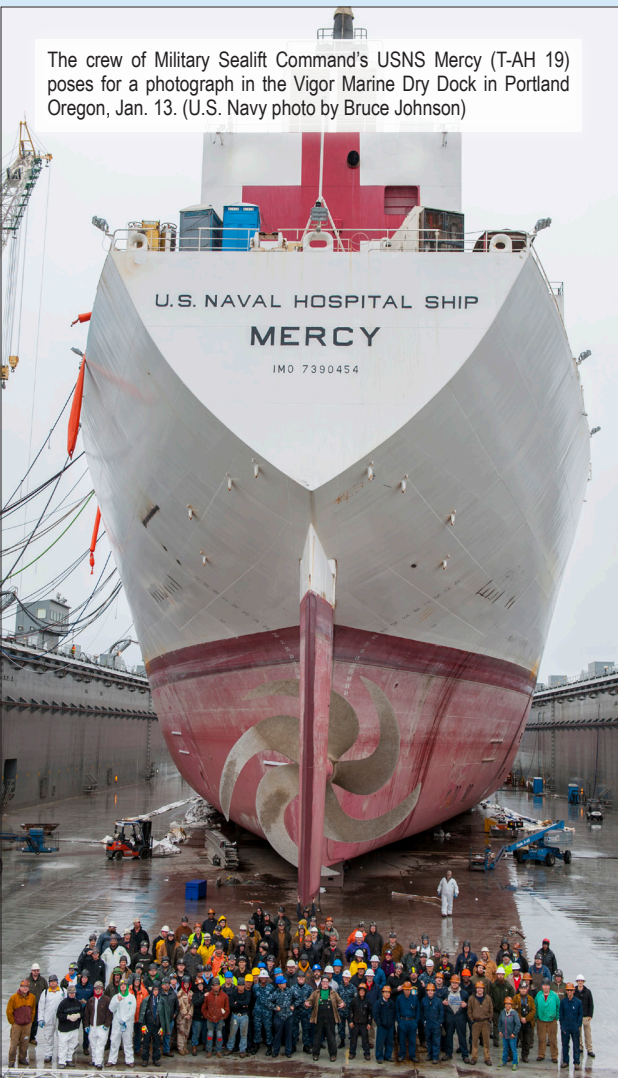
The crew of Military Sealift Command's USNS Mercy (T-AH 19) poses for a photograph in the Vigor Marine Dry Dock in Portland Oregon, Jan. 13.