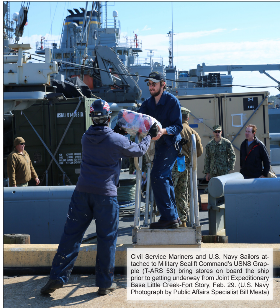
Civil Service Mariners and U.S. Navy Sailors attached to Military Sealift Command's USNS Grapple (T-ARS 53) bring stores on board the ship prior to getting underway from Joint Expeditionary Base Little Creek-Fort Story, Feb. 29.