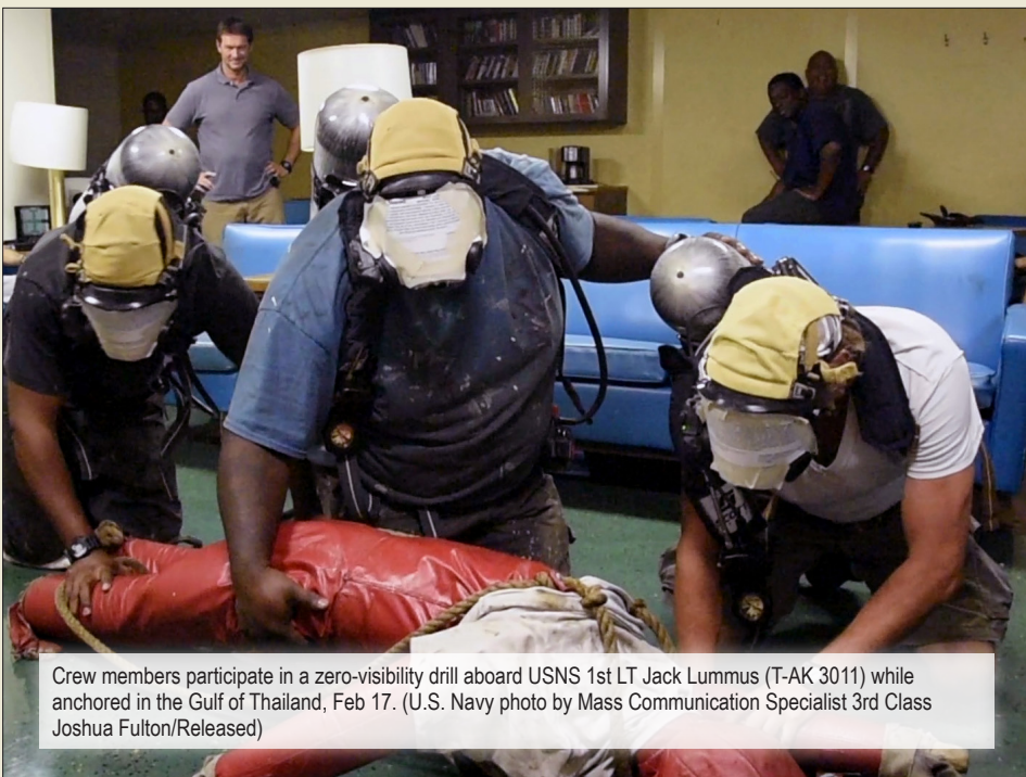
Crew members participate in a zero-visibility drill aboard USNS 1st LT Jack Lummus (T-AK 3011) while anchored in the Gulf of Thailand, Feb 17.