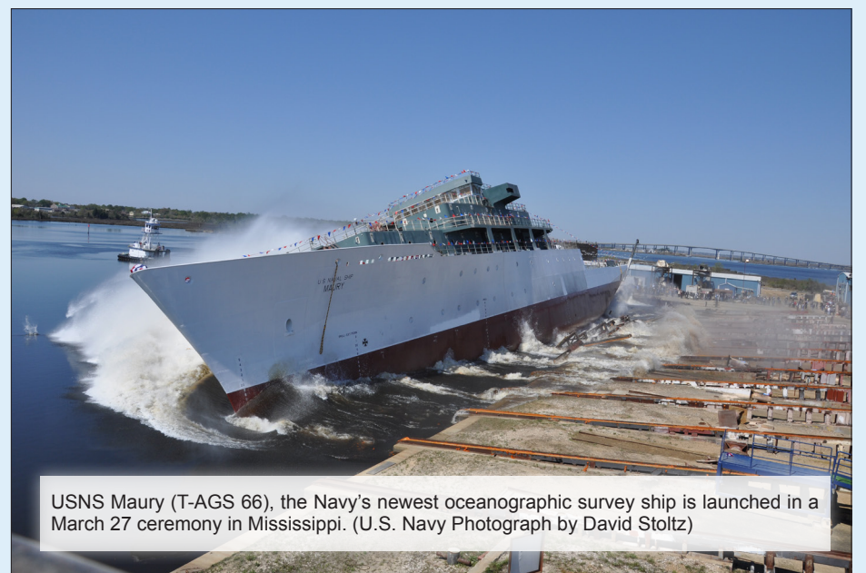
USNS Maury (T-AGS 66), the Navy's newest oceanographic survey ship is launched in a March 27 ceremony in Mississippi.

Maury will be operated by the Military Sealift Command. MSC consists of non-combatant, civilian crewed ships that replenish U.S. Navy ships.