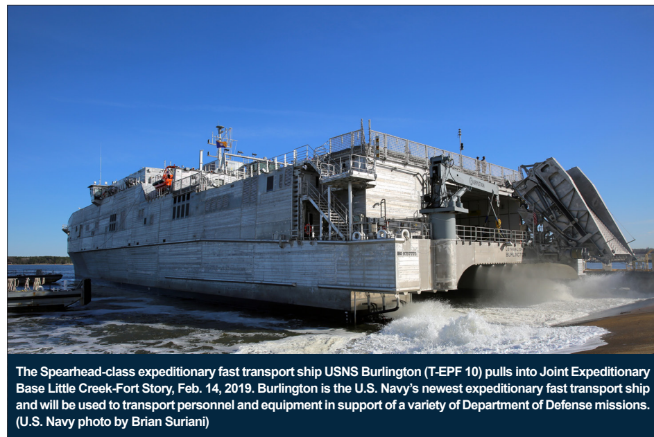
The Spearhead-class expeditionary fast transport ship USNS Burlington (T-EPF 10) pulls into Joint Expeditionary Base Little Creek-Fort Story, Feb. 14, 2019. Burlington is the U.S. Navy's newest expeditionary fast transport ship and will be used to transport personnel and equipment in support of a variety of Department of Defense missions.

"Burlington, like the other ships in the EPF program, will provide our commanders high-speed sealift mobility and agility. I am thankful for this ship and her crew who will serve our nation for decades to come and I am thankful for our industrial force teammates whose service makes this great ship possible," Spencer said.