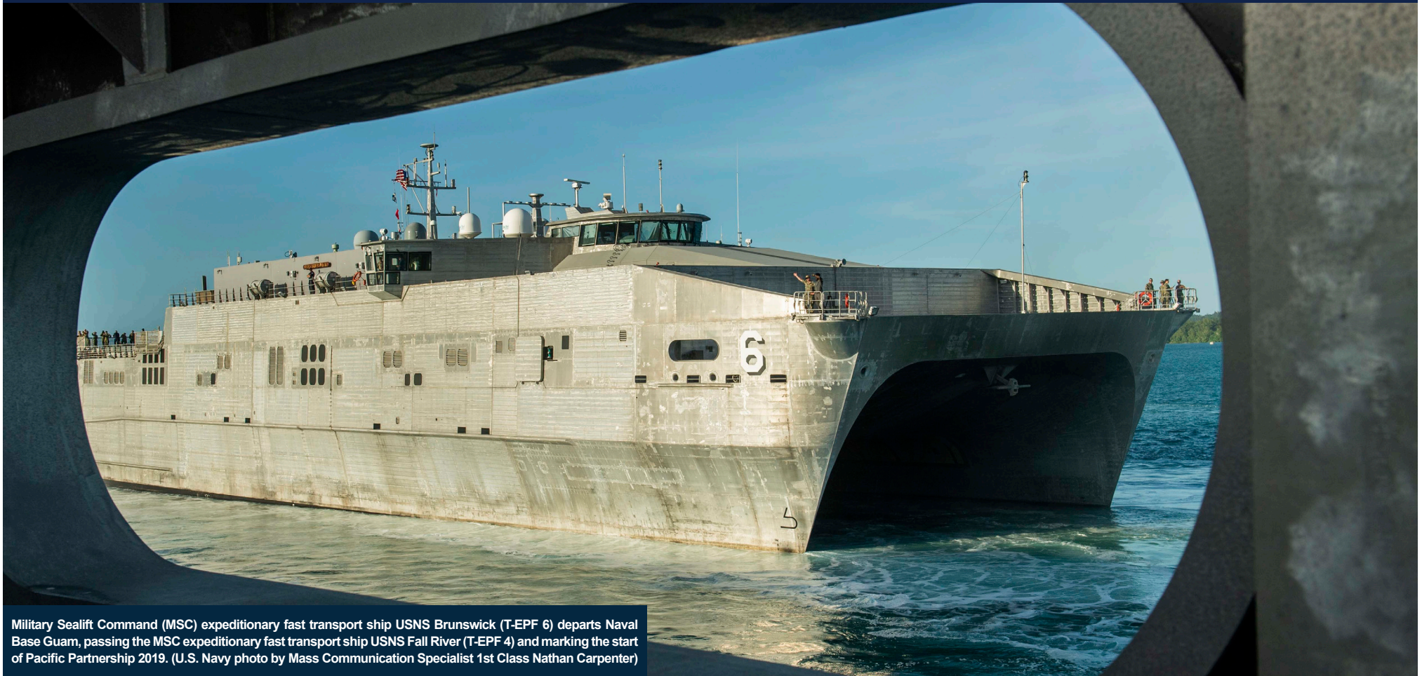
Military Sealift Command (MSC) expeditionary fast transport ship USNS Brunswick (T-EPF 6) departs Naval Base Guam, passing the MSC expeditionary fast transport ship USNS Fall River (T-EPF 4) and marking the start of Pacific Partnership 2019.

THE U.S. NAVY'S MILITARY SEALIFT COMMAND UNITED WE SAIL