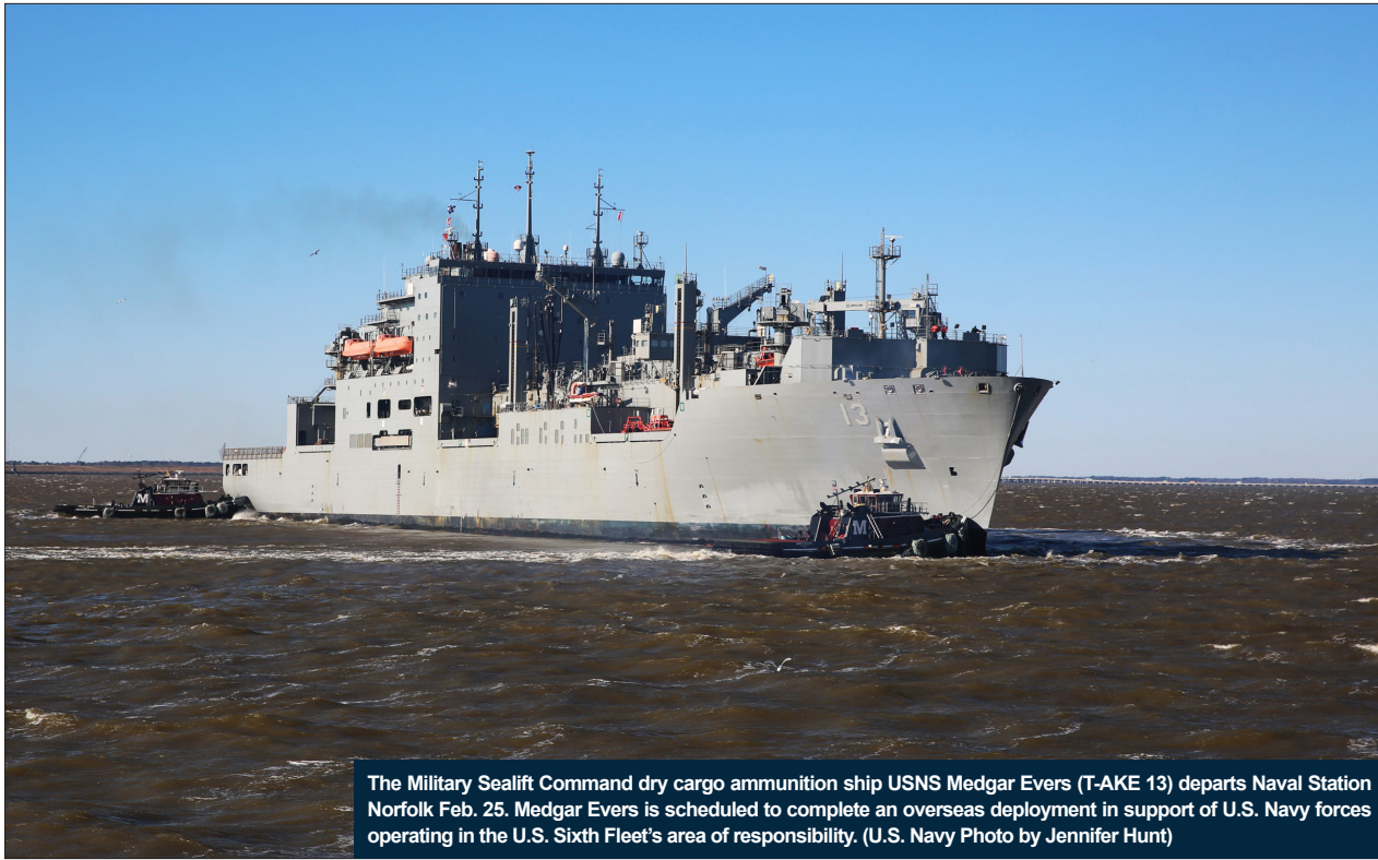
The Military Sealift Command dry cargo ammunition ship USNS Medgar Evers (T-AKE 13) departs Naval Station Norfolk Feb. 25. Medgar Evers is scheduled to complete an overseas deployment in support of U.S. Navy forces operating in the U.S. Sixth Fleet's area of responsibility.

By Bill Mesta, Military Sealift Command Public Affairs