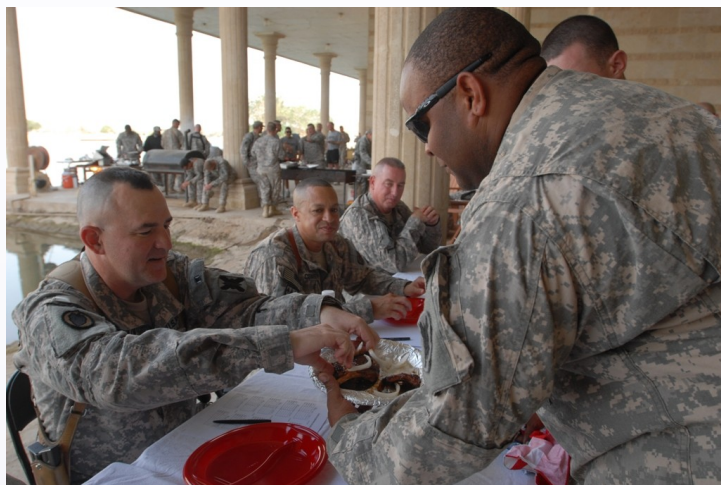
Ribs are passed out to the panel of judges during a cook off held on the patio of the Joint Visitor’s Bureau at Camp Victory in Iraq.

As part of the 256th Infantry Brigade Combat Team, 2-156th mobilized in January and deployed in support of Operation Iraqi Freedom to conduct force protection and convoy security missions during the responsible draw down of U.S. troops and equipment. The Abbeville, La., headquartered battalion is scheduled to return to Louisiana around the end of the year.