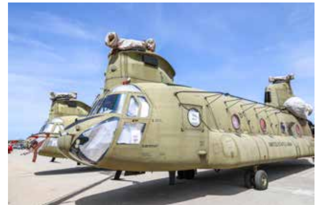
Two CH-47 Chinooks from 5th Battalion, 159th Aviation Regiment, 244th Expeditionary Combat Aviation Brigade, are staged before transport to a maintenance area and flown for Defender 23, at Naval Station Rota, Spain, April 6, 2023.