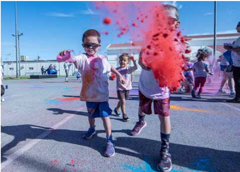
Children throw colorful chalk during Morale, Welfare and Recreation (MWR) Color Run aboard Naval Station (NAVSTA) Rota, Spain, April 1, 2023. This event kicked off April’s Month of the Military Child festivities with an explosion of colors!