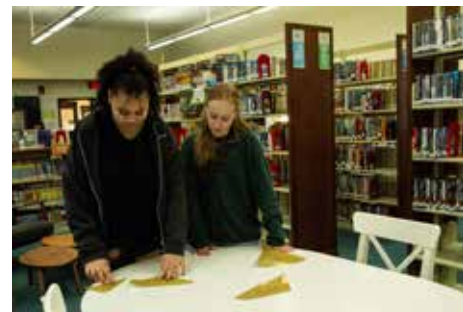
Youth work together to find clues to solve problems and hopefully escape from the base library. This was a special event put on by the MWR Library to support Rota youth.