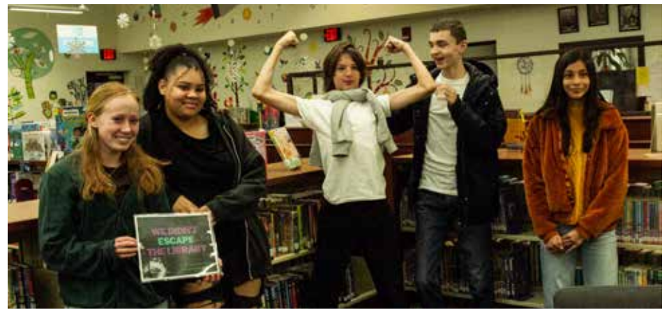
Youth from families assigned to Arleigh Burke-class guided-missile destroyers, USS Paul Ignatius and USS Bulkeley, pose for a photo at the end of a special escape room event held at the base library, Feb. 24, 2023. This was the first youth-based event coordinated by Paul Ignatius' Family Support Group.