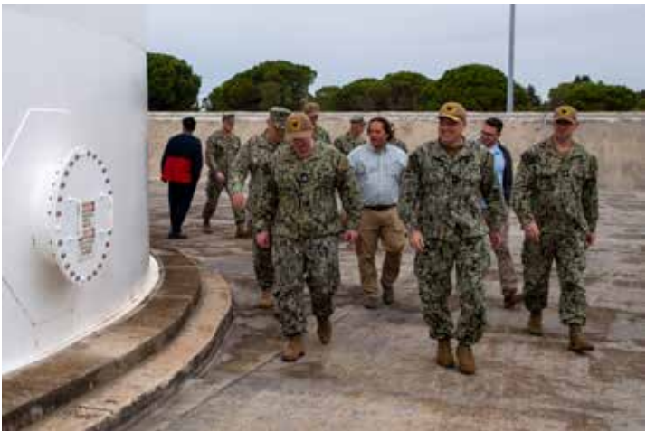
Rear Adm. Brad Collins, commander, Navy Region Europe, Africa, Central, tours fuel facilities at Naval Station (NAVSTA) Rota with leaders from NAVSTA Rota and Naval Supply Systems Command (NAVSUP) Rota, Apr 4, 2023.

The DFSP zone inspection entailed in-depth assessments of all fuels facilities and operations at the site, in order to proactively identify problems, hazards and maintenance issues that could potentially create catastrophic events. After the inspection, a deep dive