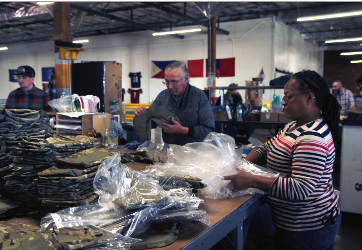
Sierra Army Depot material handlers prepare Improved Outer Tactical Vests for shipment in support of Presidential Drawdown Authority orders for military support.

The second accomplishment recognized with the FY22 AAME was SIAD's parts harvest project. It provides secondary items to support depot and Non-Mission Capable Supply (NMCS) repair programs for critical readiness drivers. The parts harvest ensures assets are available to start repair programs promptly at the beginning of the year; allows the customer to increase the repair program above forecasted annual demands; and provides parts not available in the supply system. The harvest has also opened doors to minor repair programs, combined DEMIL prep, and kitting.