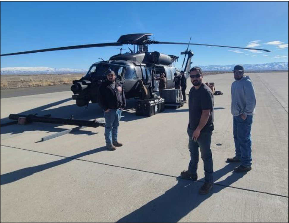
Sierra Army Depot facilities, roads and grounds