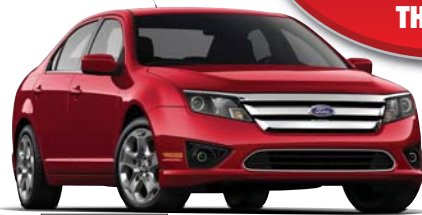
2010 MOTOR TRENDS CAR OF THE YEAR NEW 2010 FORD FUSION Stk #C2195, MSRP: $20,345