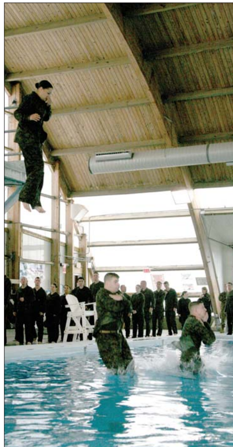
Marines with Marine Wing Headquarters Squadron 2 plunge into the Cherry Point combat pool as part of their annual swim requalification.