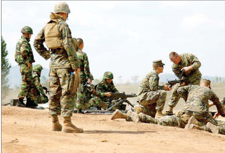
U.S. Marines, Korean and Thai service members work side-by-side as they train on the firing range at Ban Chan Khrem, Thailand, Feb. 6, as part of Cobra Gold 2010. The exercise commenced Feb. 1, and is a regularly-scheduled joint/combined exercise in the series of U.S.- Thai military exercises.

for the local community. The exercise was an overall success and beneficial for all militaries involved. From start to finish, the Marines and Sailors who participated in Cobra Gold 2010 hit the ground running and strengthened the relationship and interoperability between all countries involved.