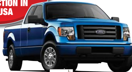
2009 MOTOR TRENDS TRUCK OF THE YEAR NEW 2010 FORD F-150 Stk #F3950, MSRP: $23,005