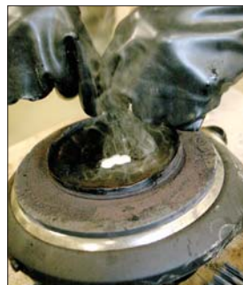
A chemical, biological, radiological and nuclear defense specialist with MWHS-2 empties a capsule of OrthoChlorobenzylidene Malononitrile, more commonly known as CS or tear gas, onto a hot plate causing the CS to be released into the air.