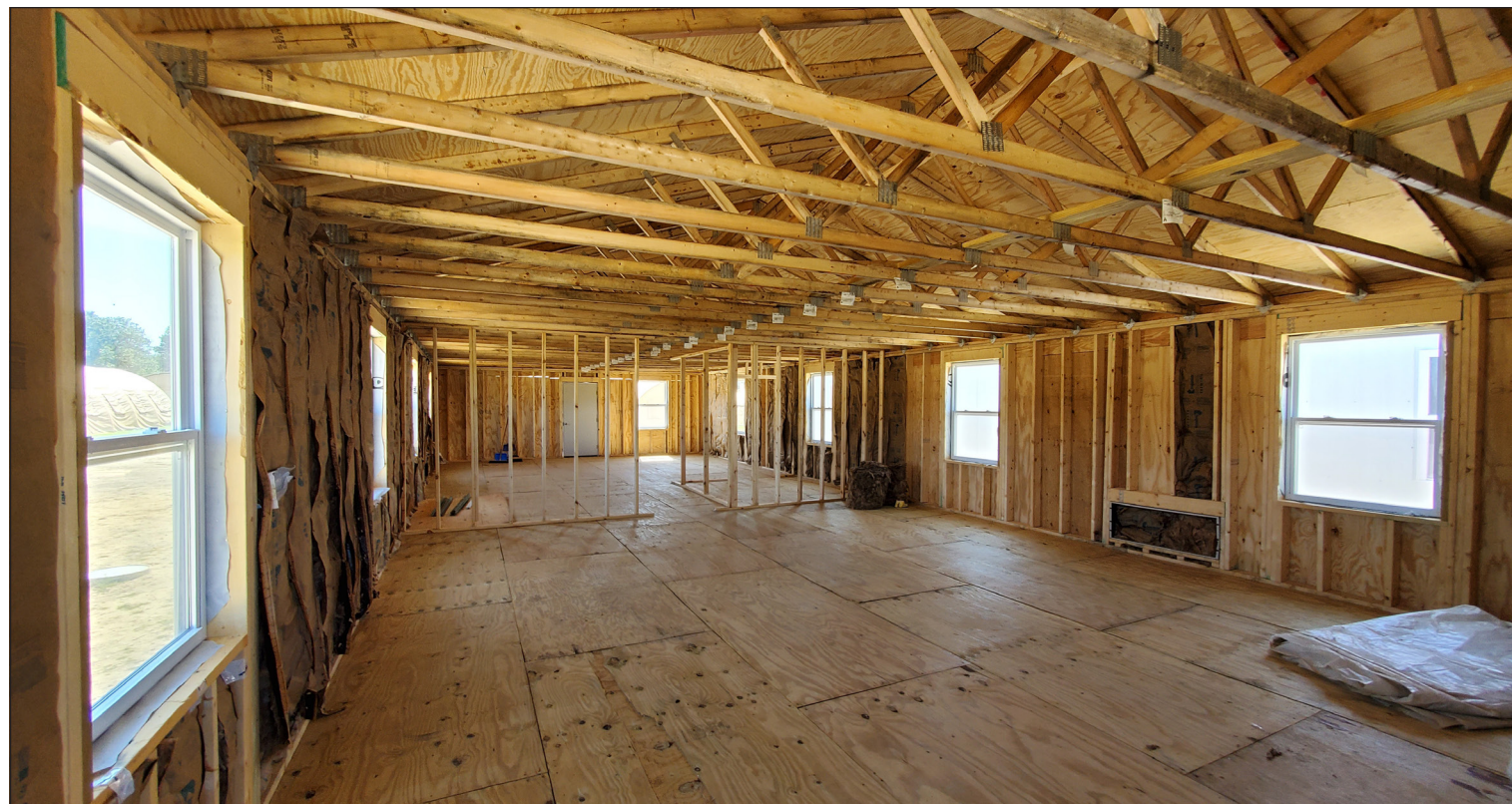
(Above and below) Construction progress on two of planned six buildings is shown Sept. 2 at Logistics Support Area Liberty on North Post at Fort McCoy. Several Army engineer units worked to raise the two buildings in 2022 as part of troop project work.