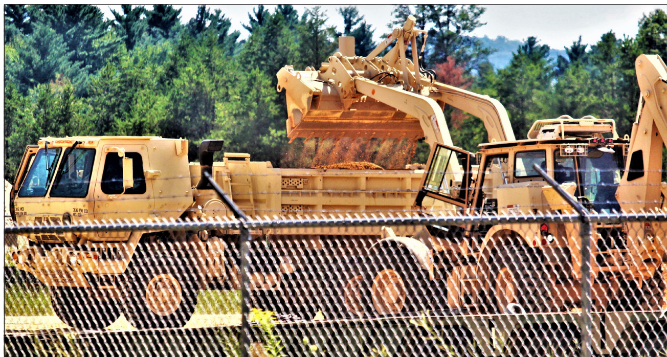
Soldiers with the 716th Engineer Company, an Army Reserve engineer company based in Summersville, N.H., work at the base operations support site troop project at Fort McCoy on Aug. 17 by moving fill dirt from the site.

For the 716th fill movement, the company used military dump