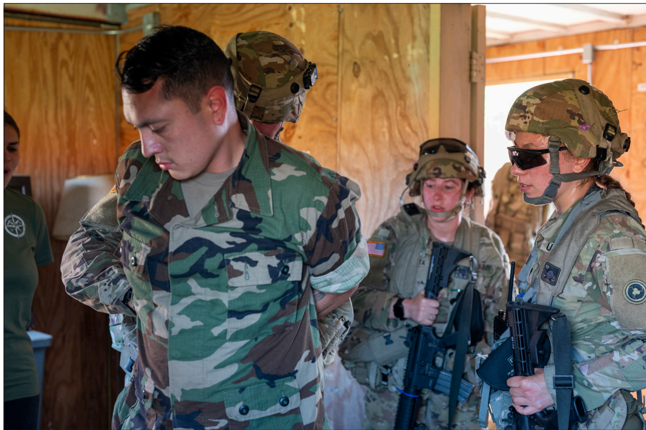
(Above and below) Soldiers participating in the 2022 Paralegal Warrior Training Course conduct detainee operations as part of the field training exercise portion of the course July 25 at Fort McCoy. The course aims to train and challenge paralegals to conduct peace and wartime missions in accordance with current law, policy and doctrinal guidance.

"There is so much to learn here," she said. "You can never learn enough when it comes to the Judge Advocate General's Corps, and the material we use to help advise commanders. Regardless of your component, this is definitely a class worth taking.