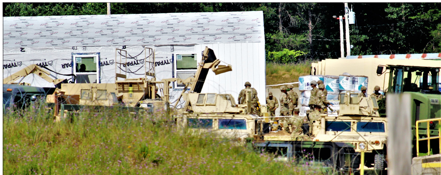
Soldiers with the 412th Engineer Vertical Construction Company of Scranton, Penn., work on a troop project July 26 to build office buildings at Logistical Support Area Liberty on North Post at Fort McCoy.

Learn more about Fort McCoy online at https://home.army.mil/mccoy , on the Defense Visual Information Distribution System at https://www.dvidshub.net/fmpao , on Facebook by searching "ftmccoy," and on Twitter by searching "usagmccoy."