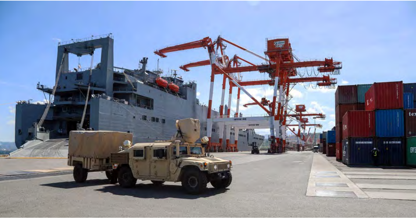
Military vehicles originating from the 402nd Army Field Support Battalion are downloaded from U.S. Navy Ship Red Cloud in preparation of Army Prepositioned Stock 3 on Feb. 24 at Subic Bay, Philippines.

countries, the preponderance of all Army FMS security assistance provided to our allies and partners.