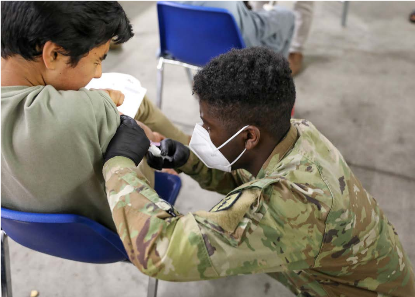
Afghan evacuees receive the Measles vaccine from 30th Medical Brigade, 21st Theater Sustainment Command personnel on Sept. 18, 2021, at Rhine Ordnance Barracks, Germany.

To address the impending billeting challenge, lodging capacity on ROB required rapid expansion. The DPC had an array of pre-constructed personnel holding areas (PHAs) that could house evacuees but lacked beds. It also lacked restrooms and showers required to accommodate the anticipated population. Planned sites