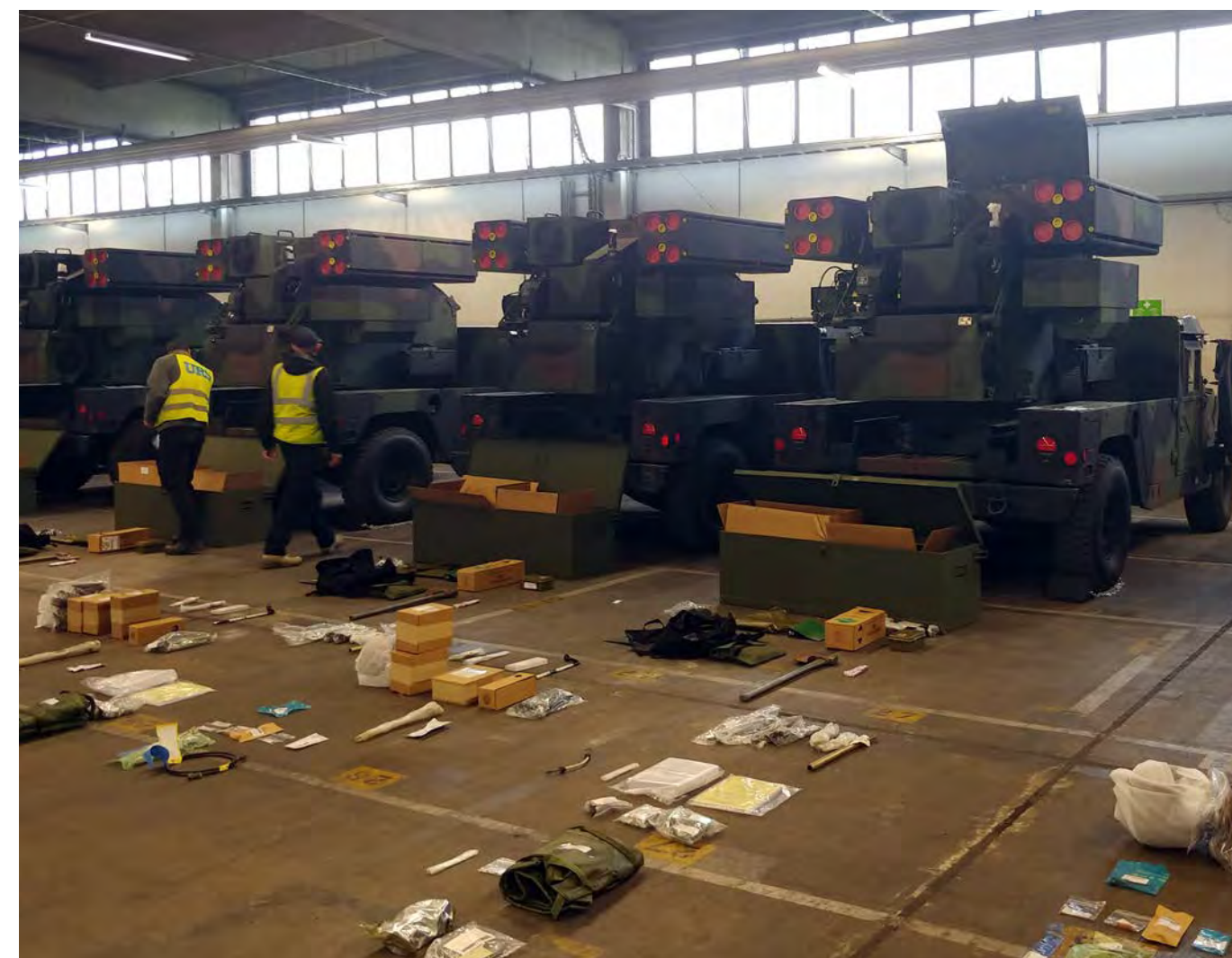
The Army Prepositioned Stock-2 site completed the fielding of 36 Avenger Air Defense Systems and 10 M1083 cargo trucks on May 2, 2018, in Dülmen, Germany. The site is set up to house a brigade's worth of vehicles and equipment as part of NATO's deterrence operations.

Each location’s lead service is charged with the Title