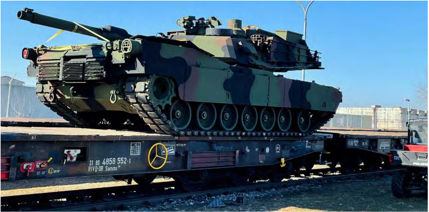
An M1A2 Abrams main battle tank is loaded onto a German rail car on March 10, at Coleman worksite in Mannheim, Germany. The 405th Army Field Support Brigade recently began augmenting its line-haul heavy equipment transporter deliveries of an entire armored brigade combat team's worth of Army Prepositioned Stocks-2 equipment with rail.

We will not fight the next war alone. Security assistance and FMS sustain strong relationships with allies and partners and build their capacity and readiness while supporting combatant commander priorities. AMC and our U.S. Army Security Assistance Command (USASAC) are critical in establishing and maintaining military partnerships through execution of its security assistance and FMS program. The AMC Security Assistance Enterprise currently executes more than 6,100 FMS cases with more than 135