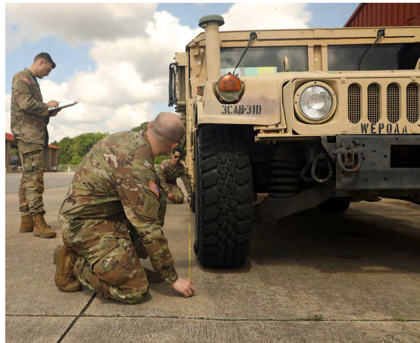
Soldiers assigned to the 258th Movement Control Team, Division Sustainment Troops Battalion, 3rd Division Sustainment Brigade, 3rd Infantry Division, inspect equipment during the 3rd Combat Aviation Brigade, 3rd ID, Emergency Deployment Readiness Exercise April 25, on Hunter Army Airfield, Savannah, Georgia.

deployment model to a short notice LSCO and rapid deployment scenario. Unfamiliarity with R2 creates an unclear line of responsibility throughout the fort to port deployment operation. Some degree of modification is needed to accommodate the operational requirements of specific installations because of infrastructure and equipment limitations, labor shortfalls and