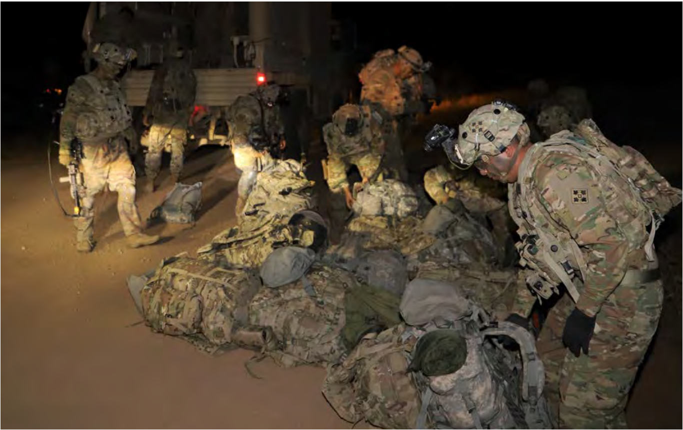
Soldiers of 2nd Battalion, 12th Infantry Regiment, 2nd Infantry Brigade Combat Team, 4th Infantry Division offload a vehicle during a training exercise on Sept. 24, 2019, at Training Area 5 at Fort Carson, Colorado. The Soldiers were transported to their helicopter landing zone by vehicles of Soldiers of 68th Combat Sustainment Support Battalion, 4th Sustainment Brigade, 4th Infantry Division prior to an air assault exercise.

designed to train a unit to perform its missions, employment, capabilities, and functions, and contain all the collective tasks designed to train the unit." Naturally, an update to a unit's METL would trigger an in-depth analysis of the training strategy. The updates mentioned above also will impact the unit task list (UTL). Per the training FM 7-0, Training , the UTL is a list of every collective task and battle drill the unit is designed to perform. The tasks on the UTL are specifically tailored to the unit and updated regularly based on mission and needs analysis by the collective training developers. These products are accessible through multiple locations online.