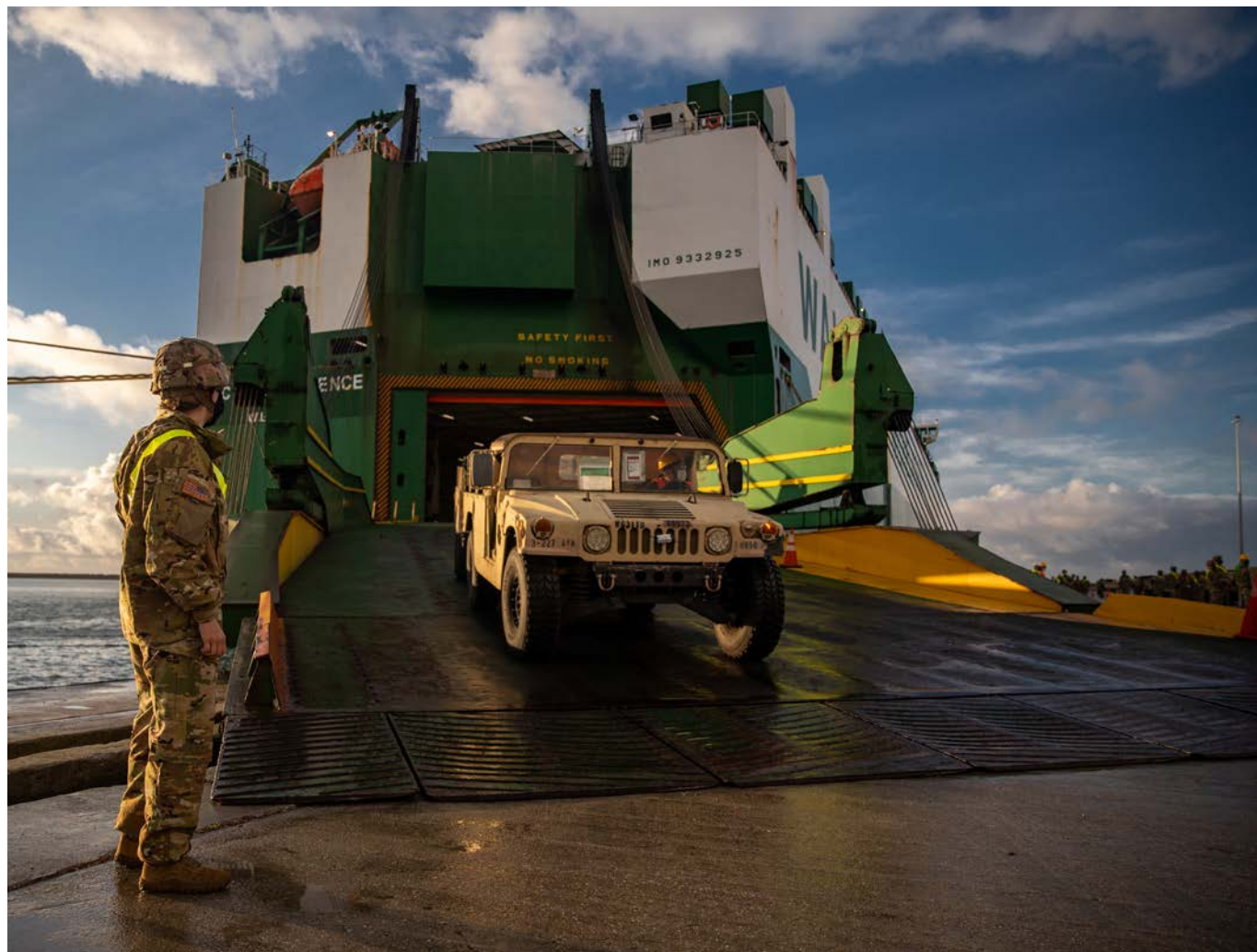
A vehicle belonging to 1st Air Cavalry Brigade (1ACB), 1st Cavalry Division (1ID), is driven down the rear ramp of the commercial vessel ARC Independence Nov. 28, 2021, at the port of Alexandroupoli, Greece, in support of Atlantic Resolve.

that change. We must constantly assess how we operate within our environment's conditions, and so much of this is enabled by our persistent engagement with industry and the suite of diverse capabilities they've brought to past, bring to current, and provide for future fights across any given condition.