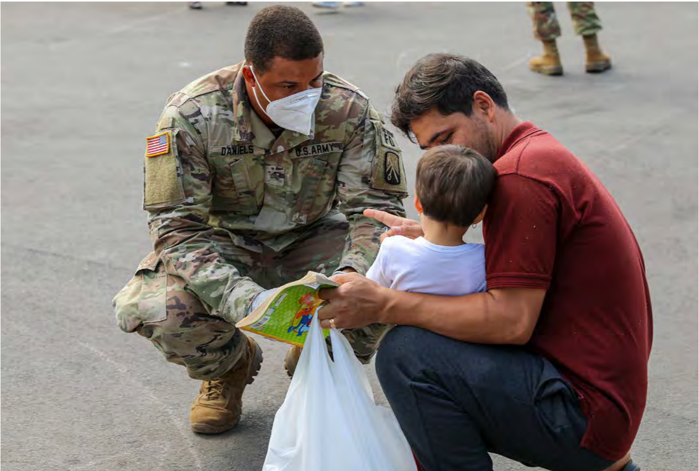
Soldiers from 21st Theater Sustainment Command provide security and assistance to Afghan evacuees at the transit area known as pod 51 on Sept. 9, 2021, at Ramstein Air Base, Germany. The transit center provides a safe place for the evacuees to complete their paperwork while security screenings and background checks are conducted before they continue on to their final destination.

for the other LSAs had no preexisting infrastructure and required temporary tents and ancillary facilities to be emplaced. This merited heavy reliance on contractors to provide tents, climate control, restrooms, and showers. Contractors also provided the DPC and the outlying LSAs with toilets and showers, which CORs inspected daily for serviceability.