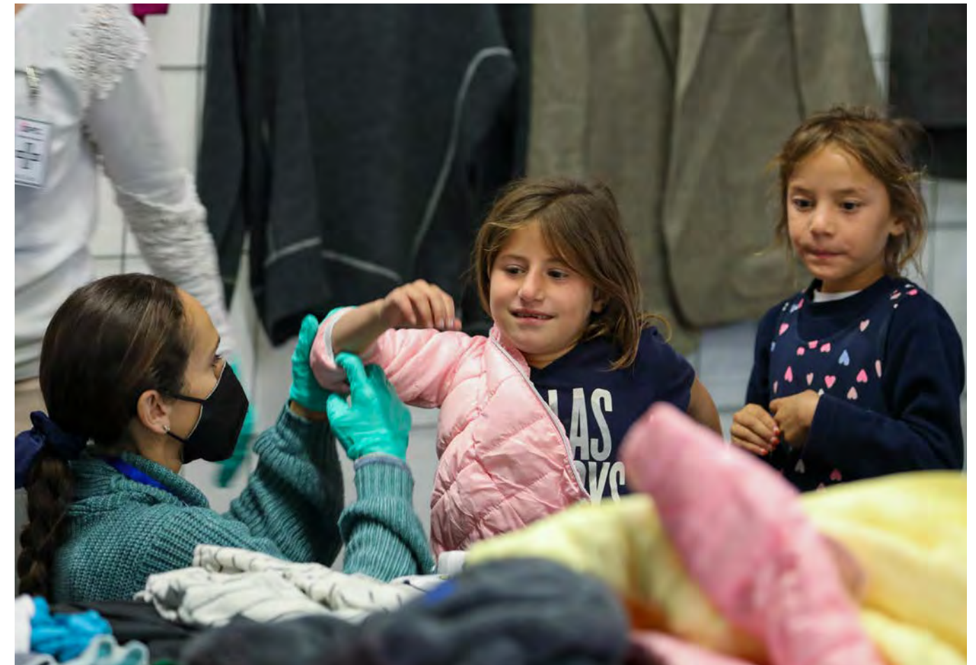
Volunteers and 21st Theater Sustainment Command Soldiers from the Kaiserslautern community give Afghan evacuees cold weather clothing items on Sept. 22, 2021, at Rhine Ordnance Barracks. The clothing came from donations from the local community.

Class II and VI supplies distribution occurred primarily from the DPC's central processing building because the DPC was the largest distribution site within the task force. External LSAs would draw from DPC stocks to fulfill their supply demands. This central processing building processed all evacuees to the DPC camp and most of the evacuees to other LSAs. It evolved into three independent sections managed by volunteer leaders and overseen by DPC leadership: the Red Cross distribution point, the USO distribution point, and a miscellaneous donations distribution point. The Red Cross provided comfort kits, including hygiene items and blankets. The USO provided donated clothes and winter wear to the evacuees unused to the cold German weather. The miscellaneous distribution point provided a baby bottle exchange service, donated