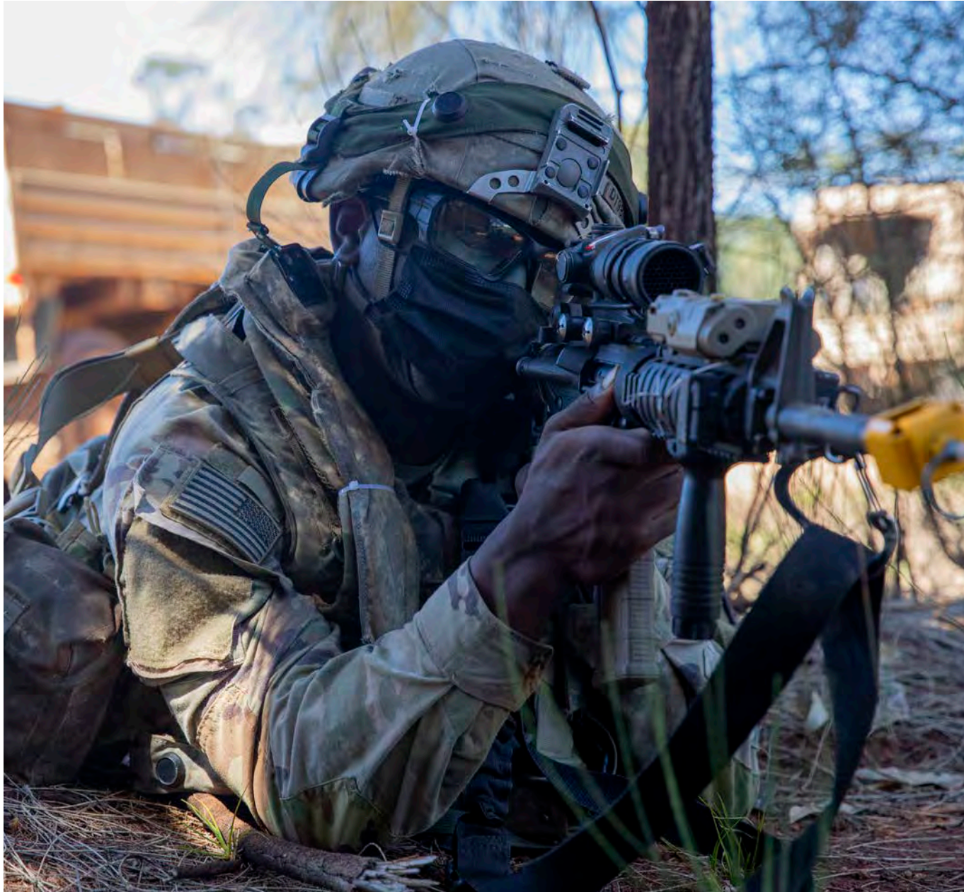
A Soldier with 325th Brigade Support Battalion, 25th Infantry Division, reacts to indirect fire during a convoy movement as part of a Home Station Combat Training Center brigade level collective training event on Oct. 20, 2021, at the Joint Pacific Multinational Readiness Center, East Range, Schofield Barracks, Hawaii. JPMRC Rotation 22-01 is a Home-Station Combat Training Center (HS-CTC) rotation that will build combat readiness in America's Pacific Division.

support realms; a frame of mind that truly embodies the idea of warrior logisticians.