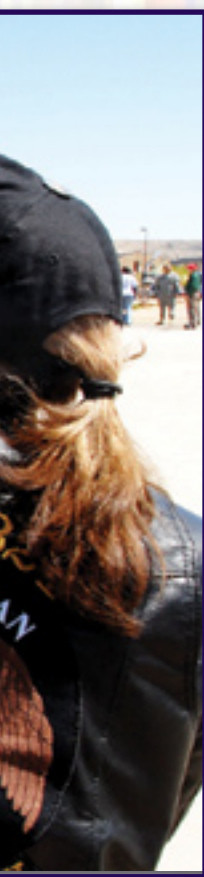
ts while attending