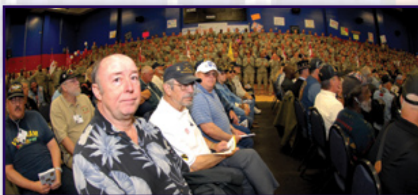
Veterans from the Vietnam War fill the center of Freedom Fitness Gym during Fort Irwin's Welcome Home Ceremony for Vietnam War Veterans.