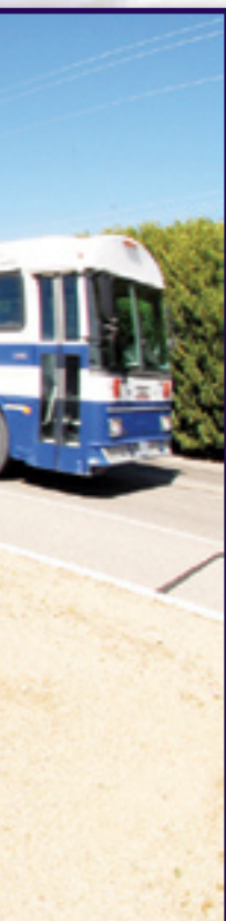
ground, holds up a Veterans were on