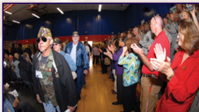
Veterans from the Vietnam War era enter the Freedom Fitness Gym to applause and cheers from Soldiers and the Fort Irwin community.