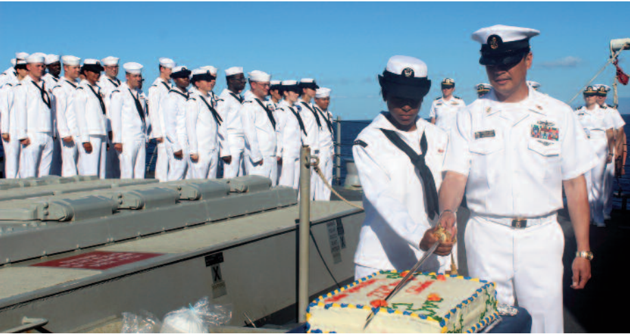
USS Chafee Sailors cut a cake to commemorate the Navy's 237th birthday.

"We are working together to get the message out," he said. "Sailors are much more educated about synthetic drugs. We have had fewer positive urinalysis results."