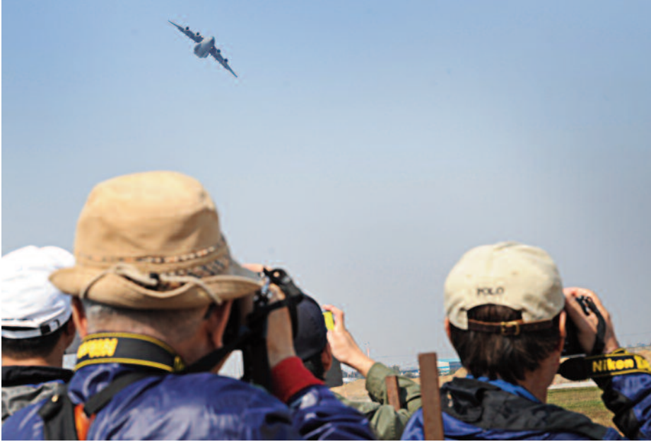
Spectators at the "Air Power Day" air show take photos of a C-17 Globemaster III from the 15th Wing at Joint Base Pearl Harbor-Hickam as it performs an aircraft demonstration Oct. 20 at Osan Air Base, Republic of Korea.

“The [purpose of the] C-17 demonstration is to project a positive image of the U.S.