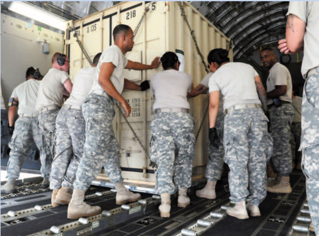
Soldiers of the 8th Theater Sustainment Command, Special Troops Battalion, Fort Shafter, load equipment aboard a C-17 aircraft on Joint Base Pearl Harbor-Hickam Oct. 22.