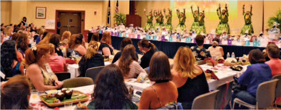
Hawaiian dancers perform during the Joint Spouses Conference on Ford Island.