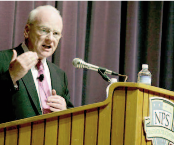
Richard A. Clarke

“Some historians believe that the U.S. Navy defeated the Imperial Japanese Navy precisely because of code-breaking skills. Certainly the decisive U.S. victory in the Battle of Midway was due to the advanced knowledge of Japanese plans gained from code-breaking.”