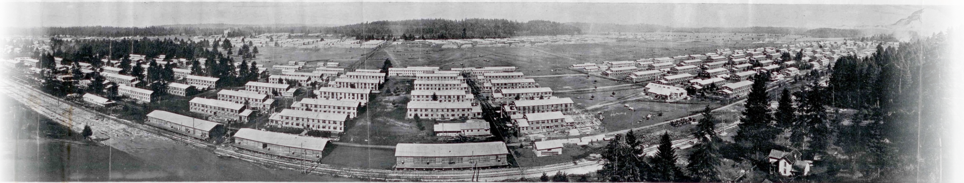
Camp Lewis, Washington