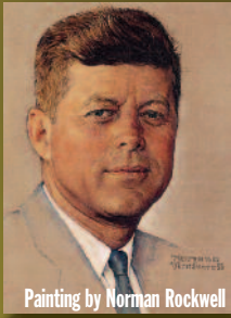
Painting by Norman Rockwell

"I can imagine no more rewarding a career. And any man who may be asked in this century what he did to make his life worthwhile, I think can respond with a good deal of pride and satisfaction: 'I served in the United States Navy.'"