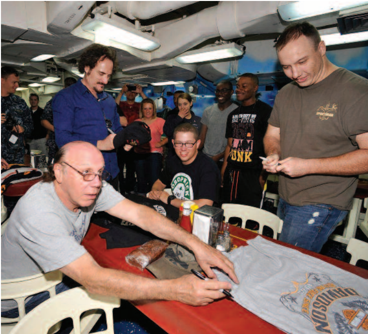
Actors Dayton Callie and Kim Coates signed autographs and visited with the crew of the Hopper.