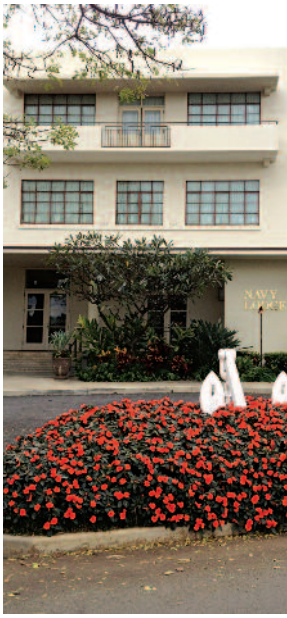
The front entrance of Navy Lodge Hawaii

"The rooms are set up with kitchen amenities, microwave and refrigerator.