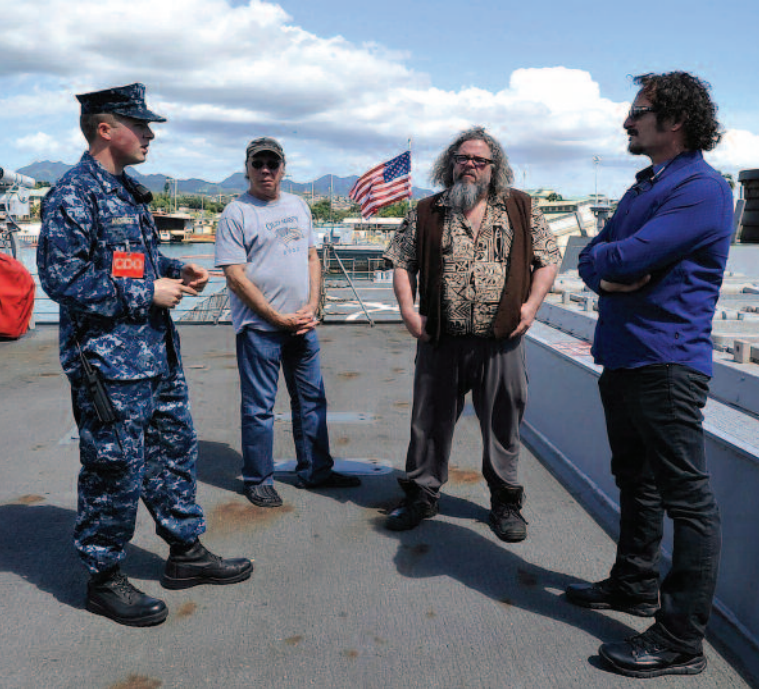
Mark Boone Jr., Dayton Callie and Kim Coates, actors on the FX drama “Sons of Anarchy,” tour the engineering spaces aboard the USS Hopper (DDG 70).