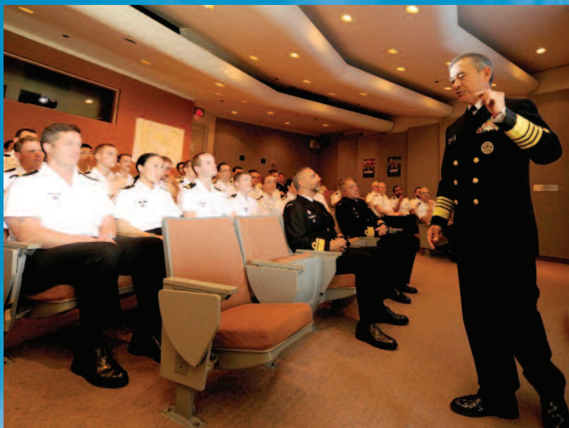
Adm. Harry Harris Jr., commander of U.S. Pacific Fleet, gives a presentation about the United States' rebalance to the Pacific to more than 50 Canadian officers at the Naval Officer's Training Center in Victoria Canada on Oct. 7.