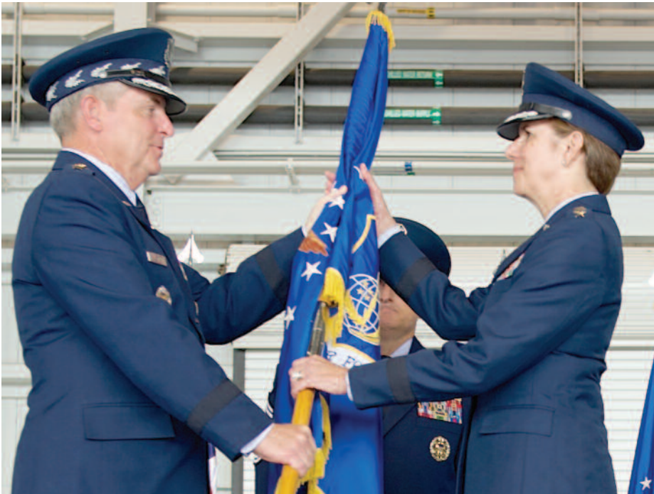
Gen. Lori Robinson (right), Pacific Air Forces commander, receives the PACAF flag from Air Force Chief of Staff Gen. Mark A. Welsh III during the PACAF change of command ceremony held Oct. 16 at Joint Base Pearl Harbor-Hickam.

Gen. Lori Robinson took command of Pacific Air Forces from Gen. Hawk Carlisle Oct. 16 during a change of command ceremony held Oct. 16 at Joint Base Pearl Harbor-Hickam. Presiding over the ceremony, Air Force Chief of Staff Gen. Mark A. Welsh III praised Carlisle's past accomplishments and expressed confidence in Robinson as the new commander of PACAF. "Gen. Lori Robinson is a phenomenal leader and a proven operator," Welsh said. "She fully understands what it takes to be successful in this business and has all the tools to take this command to even higher levels of performance." During his command, Carlisle executed PACAF's