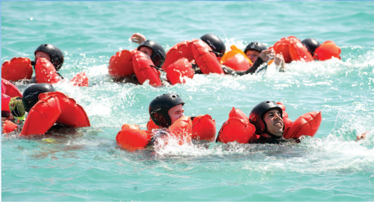
U.S. Air Force Airmen tread water and move toward an objective during a survival, evasion, resistance and escape (SERE) water survival refresher course Oct. 6, at Joint Base Pearl Harbor-Hickam, Hawaii.