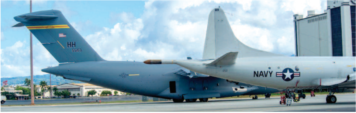
A P-3 Orion maritime patrol aircraft sits next to a C-17 Globemaster III on the Joint Base Pearl Harbor-Hickam, flightline Oct. 2. Navy and Marine Corps aircraft have temporarily relocated to JBPHH due to airfield construction at Marine Corps Air Station Kaneohe Bay. The aircraft commenced flying operations here Oct. 1.

According to Glen Bailey, 15th Wing plans and pro-