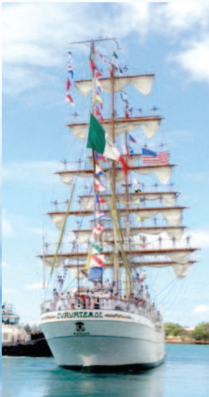
Sailors man the rails and sails as the Mexican ship ARM Cuauhtémoc departs Honolulu Harbor on Oct. 10 as part of its America 2014 global training cruise. Throughout its history, the ship has sailed the seas of the world to transmit a global message of friendship and goodwill. It arrived in Honolulu on Oct. 6.