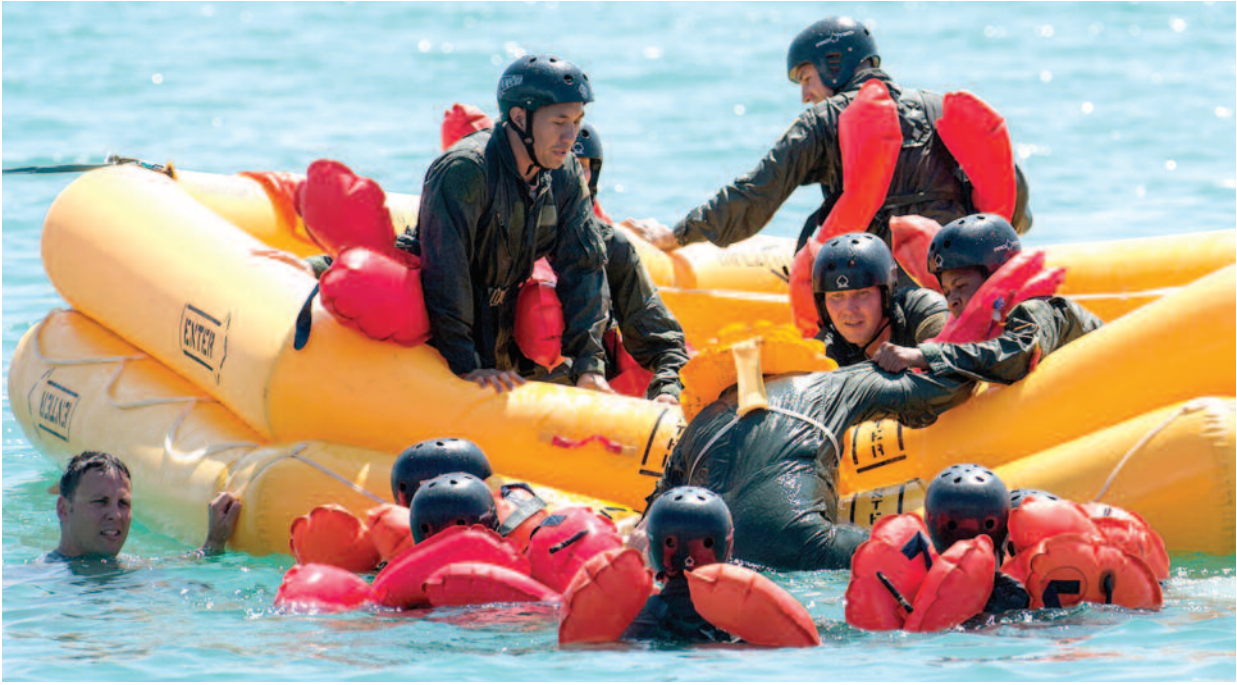
Air Force Airmen participate in a survival, evasion, resistance and escape (SERE) water survival refresher course Oct. 6 at Joint Base Pearl Harbor-Hickam.

"Today was the kickoff," Garcia said. "Every 36 months, aircrew members go through a refresher requirement to get trained on all