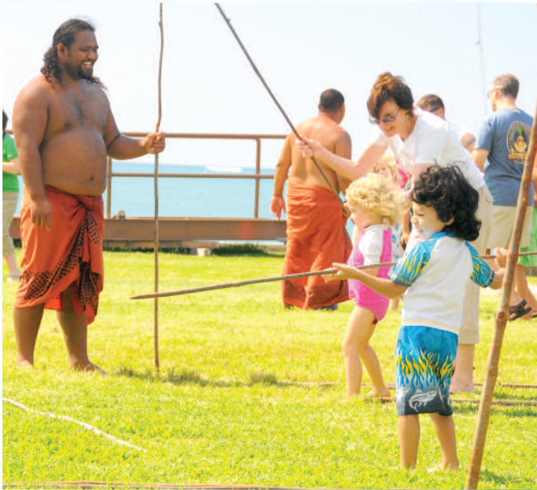
A boy prepares to throw a spear in the maka ihe competition at the makahiki festival. Maka ihe tests the ancient Hawaiian battle skill of throwing a spear with strength and accuracy. The annual makahiki festival will be held beginning at 9 a.m. Nov. 8 at Hickam Harbor Beach in front of Sam Choy's Seafood Grille.