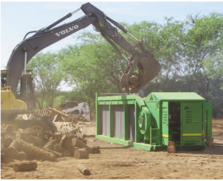
An air curtain burner is loaded with palm logs for incineration. Rotting palm trees can become material for coconut rhinoceros beetle nests.

Composting has also been used to treat infested mulch by maintaining it at a high enough temperature to kill any beetles or eggs. The air curtain burner was acquired to