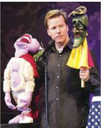
(Above): Two of Dunham's original friends, Peanut and Jose Jalapeño.