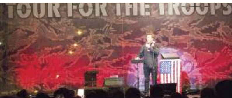
Dunham's show was part of his international Tour for the Troops.