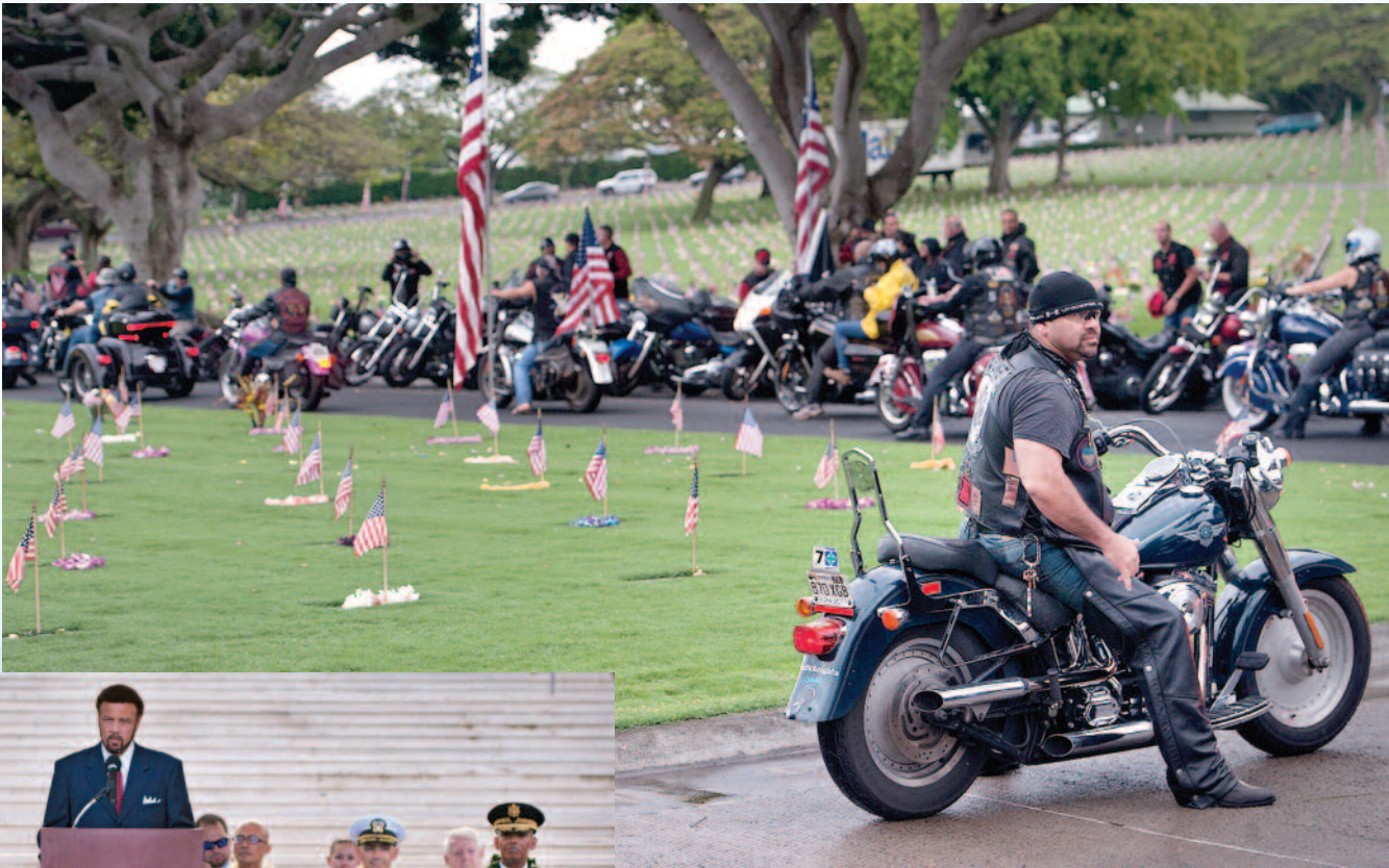
(Above) Motorcyclists arrive at the National Memorial Cemetery of the Pacific (Punchbowl) to honor prisoners of war and those missing in action from the Vietnam War during a Memorial Day eve candlelight ceremony on May 25.