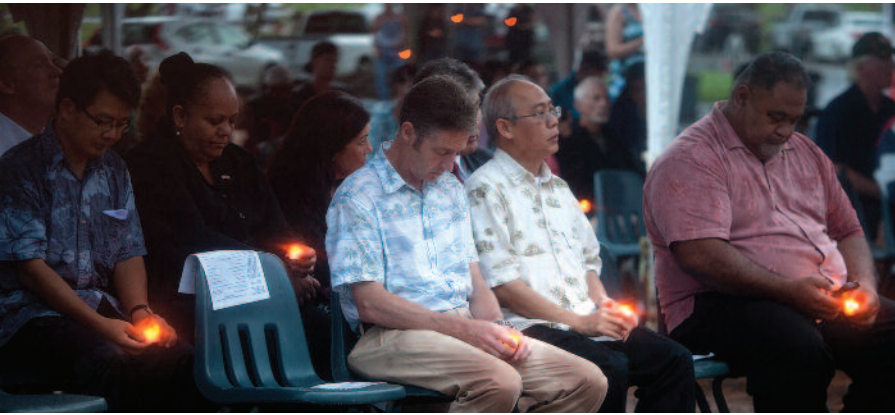
Candles are lit to honor the memory of the fallen and missing in action during a Memorial Day eve candlelight ceremony May 25 at the National Cemetery of the Pacific in Honolulu (Punchbowl). (See additional photo on page A-5.)