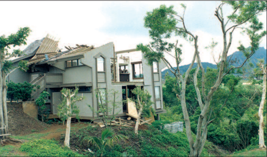
Hurricanes can be very destructive. Be sure to go to an evacuation center if conditions are unsafe at home.

is important to have a plan for your pets. If an evacuation is necessary, it is best to already know which shelters do and do not allow pets and to have the necessities on hand to continue to care for them.