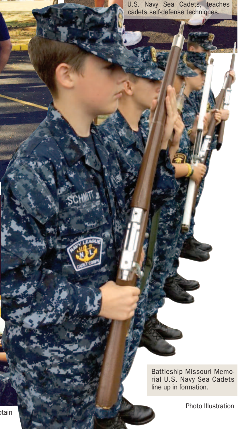
Battleship Missouri Memorial U.S. Navy Sea Cadets line up in formation.