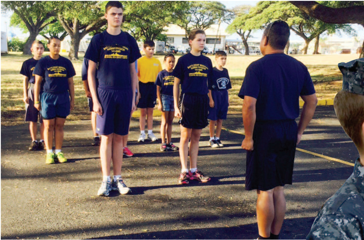
Sea Cadets fall into quarters for muster and instruction before physical training.