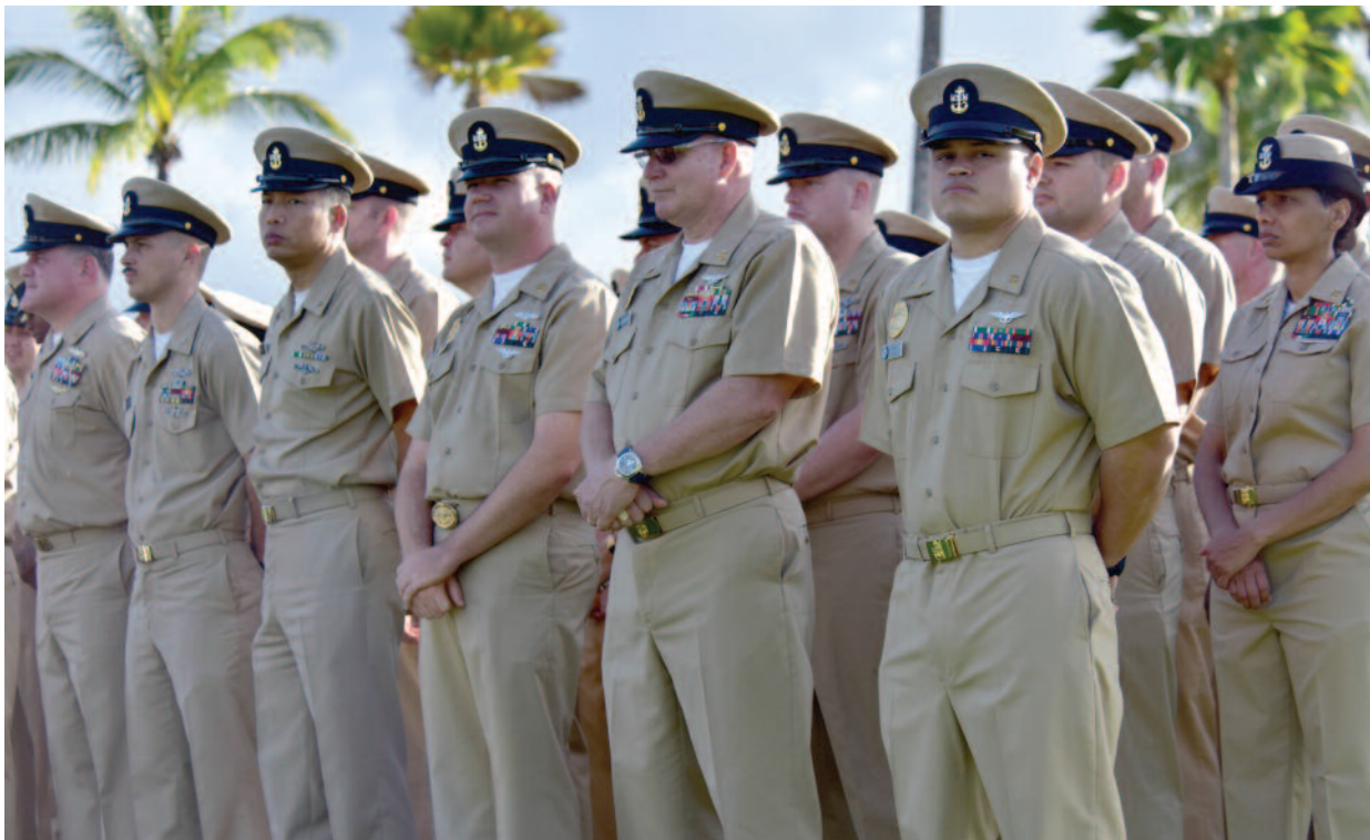
Chief petty officers from around Hawaii attend a gathering for morning colors at the World War II Valor In the Pacific National Monument to celebrate the 122nd anniversary of the Navy's chief petty officer rank.