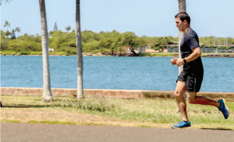
A volunteer runner jogs on the running path overlooking Pearl Harbor during the tactical air control party (TACP) 4th Annual TACP Remembrance Run at Joint Base Pearl Harbor-Hickam.

“I’ve lost three friends from the TACP community in the last three years and, in each of those cases, the association helped out a lot, so this is something that hits close to home