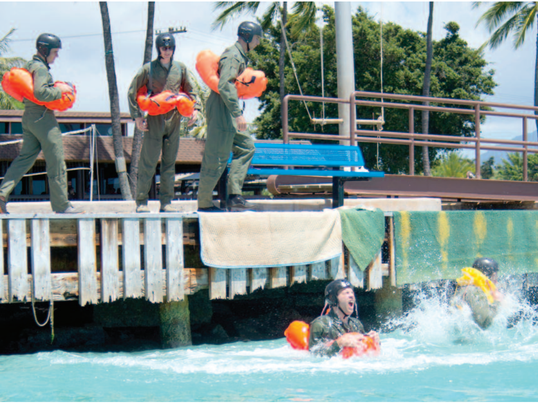
Airmen from the 535th Airlift Squadron, 65th Airlift Squadron and the 96th Air Refueling Squadron jump into Hickam Harbor to simulate exiting an aircraft that has landed in the ocean during water survival training on March 23 at Joint Base Pearl Harbor-Hickam. Water survival training is completed on triennial basis for all aircrew assigned to the 15th Wing.

According to Ray, training is conducted 12 months a year, including six unit-training assembly weekends for the National Guard