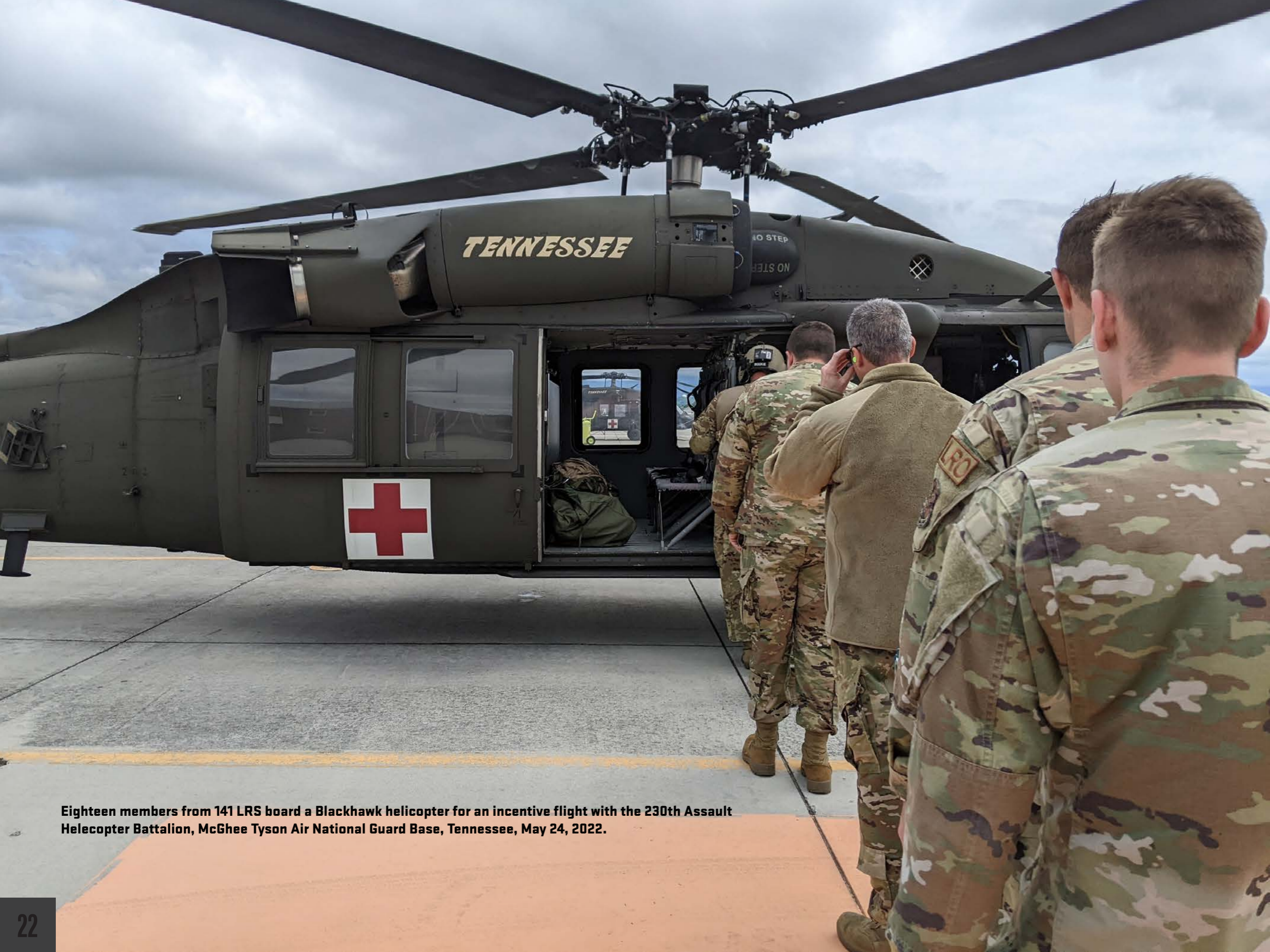
Eighteen members from 141 LRS board a Blackhawk helicopter for an incentive flight with the 230th Assault Helicopter Battalion, McGhee Tyson Air National Guard Base, Tennessee, May 24, 2022.