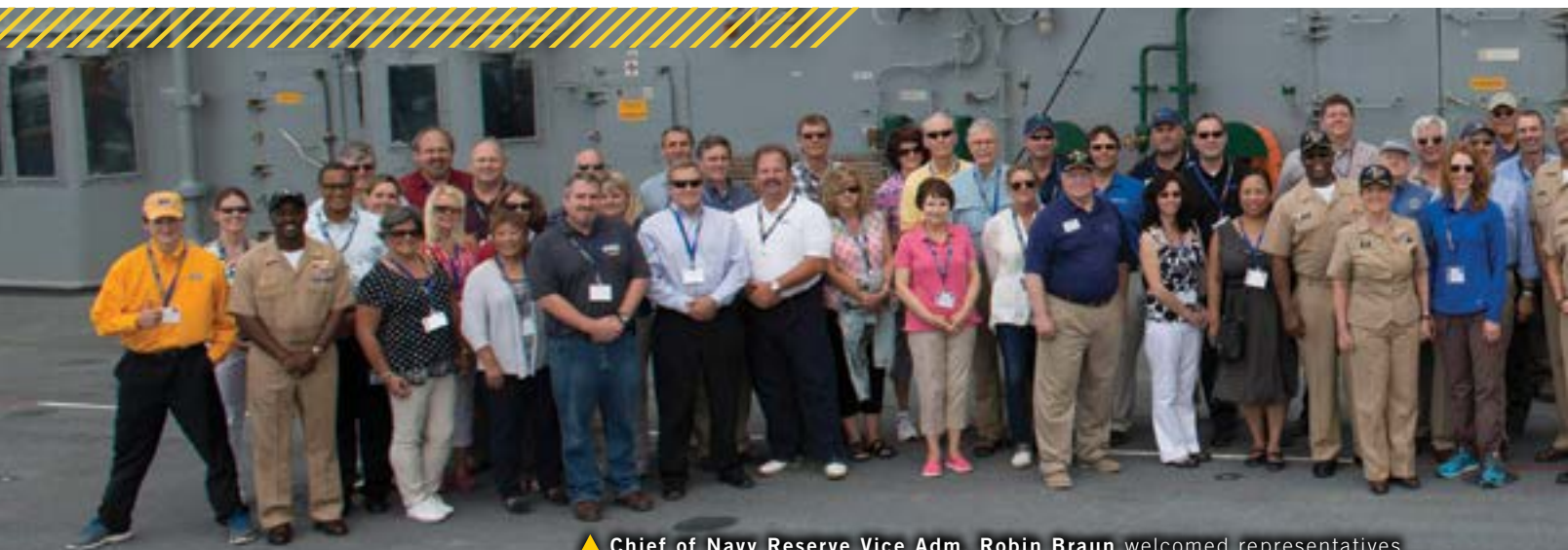
▲ Chief of Navy Reserve Vice Adm. Robin Braun welcomed representatives from 39 civilian employers of Reserve Sailors to Joint Expeditionary Base (JEB) Little Creek for the 2014 Navy Employer Recognition Event June 20, 2014. Selected employers were nominated by their Navy Reserve Sailor employees and invited to attend the one day event that included tours of Navy Expeditionary Combat Command, the USS Iwo Jima (LHD 7), a static display of aircraft and a demonstration by SEAL Team 18.

According to Braun, the service each Sailor provides to the Fleet is achieved in no small part to their employer's support. By