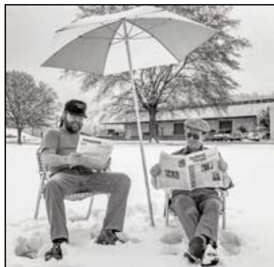
In 1987, while on break, a couple of depot employees take a moment to read the latest news from the Federal Times and TRACKS publications.

Newspapers: The Anniston Star will post information