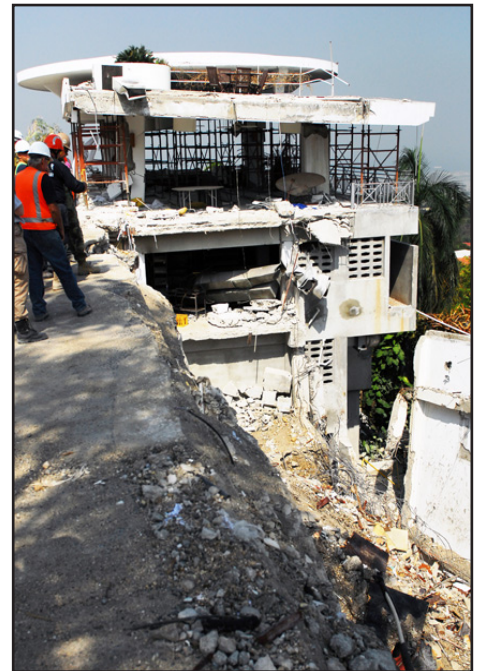
Service members and civilian contractors survey the damage caused by the quake to the Hotel Montana in Haiti. The earthquake on Jan. 12 almost completely destroyed the four-star hotel.