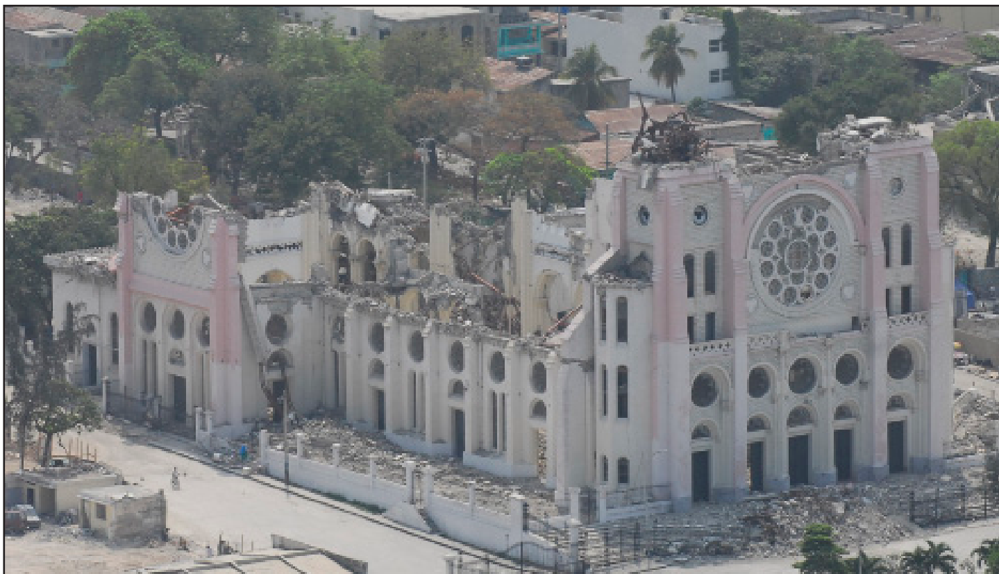
The National Cathedral of Haiti was destroyed during the earthquake that struck Haiti on Jan. 12. Even though the cathedral was destroyed, Port-au-Prince locals still gather in front on Sundays to worship.