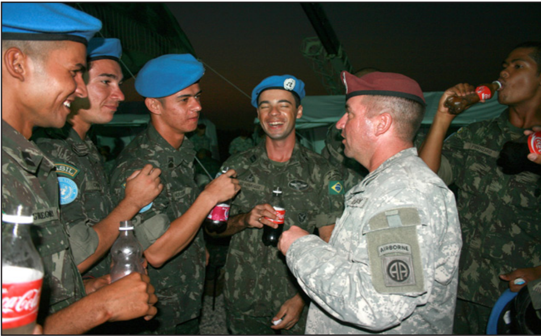
An American Airborne trooper takes time out to strengthen partnerships and friendships with his Brazilian brethren.