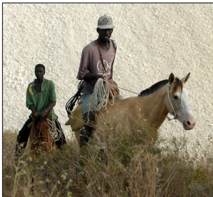
Locals in the mountains near Port-au-Prince have tamed wild horses and use them to get around the mountainside.