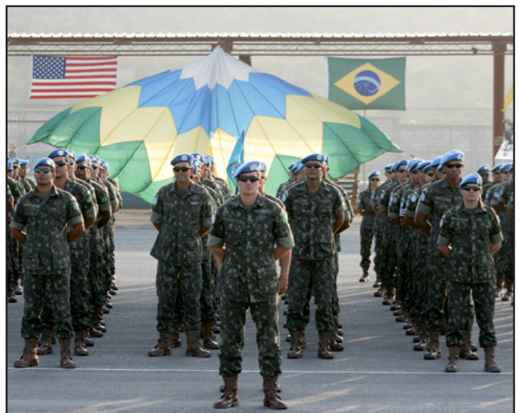
Brazilian Airborne troops stand in formation during a ceremony in honor of the accomplishments of the Airborne Soldiers at a UN compound in Haiti.