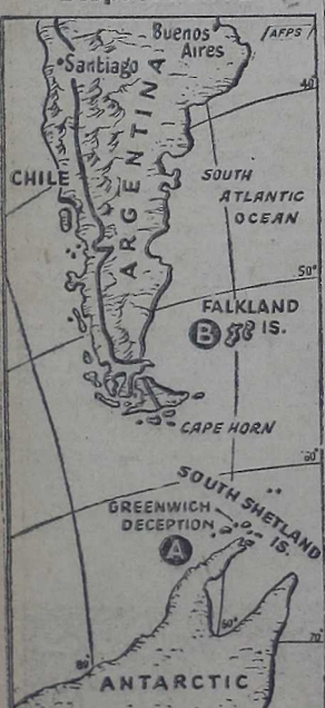
Map indicates area involved in dispute between Great Britain, Chile and Argentina, all of which have national interests in the Falkland Island dependencies in South Shetland Islands (A). They are about 800 miles south of Falklands (B), which are British. Chile asserts sovereignty over Greenwich Island, and Argentina claims deception. British cruiser Nigeria left a Naval base in South Africa recently en route to area, presumably to protect British claims.