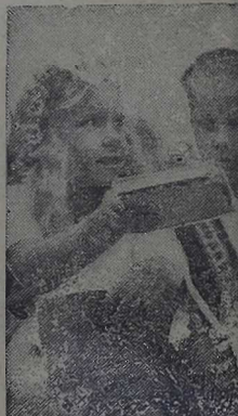
Gift boxes from American Red Cross members for joy to these little Latvian at the Darmstadt, Germany, placed persons center.