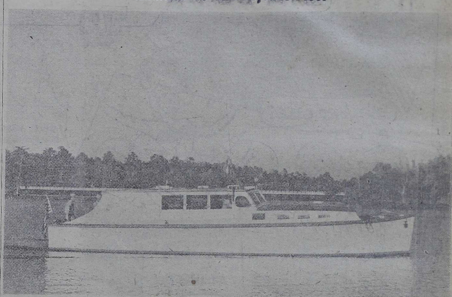
Newest addition to the Camp Lejeune fleet is this handsome, 45-foot cabin cruiser, recently purchased by Camp Special Services from Naval Air Station, Pensacola, Fla. Intended for use by Lejeune personnel for recreational purposes, the sea-worthy craft has twin Gray marine engines, sleeps six comfortably, and is equipped with a galley and head.