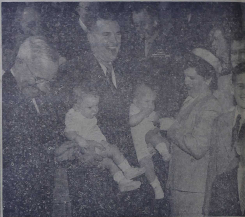
The president had a hard time getting past the twins, but he did read the citation, did the Medal of Honor around Col. Justice M. "Jumping Joe" Chambers' neck and did retire before he could snatch the handkerchief from the presidential breast pocket.

During his last tour of duty, he served with the first Marine guard detachment to be sent to Palestine following the Jewish-Arab fighting.