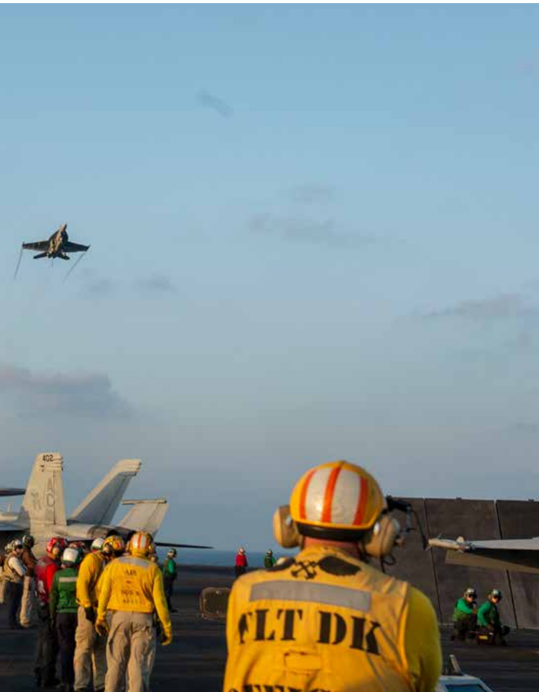
MAY 25, 2021 A F/A-18E Super Hornet fighter jet, attached to the "Rampagers" of Strike Fighter Squadron (VFA) 83, flies over IKE.