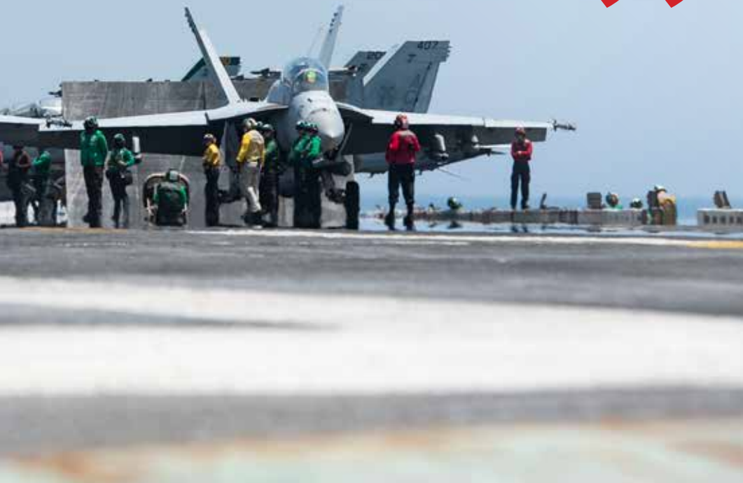
APRIL 29, 2021 Two F/A-18F Super Hornet fighter jets attached to the “Fighting Swordsmen” of Strike Fighter Squadron (VFA) 32, prepare to take off from the flight deck.

“ IT MAKES ME HAPPY KNOWING THAT WE ARE ABLE TO ENSURE THAT THE TROOPS GET HOME ”