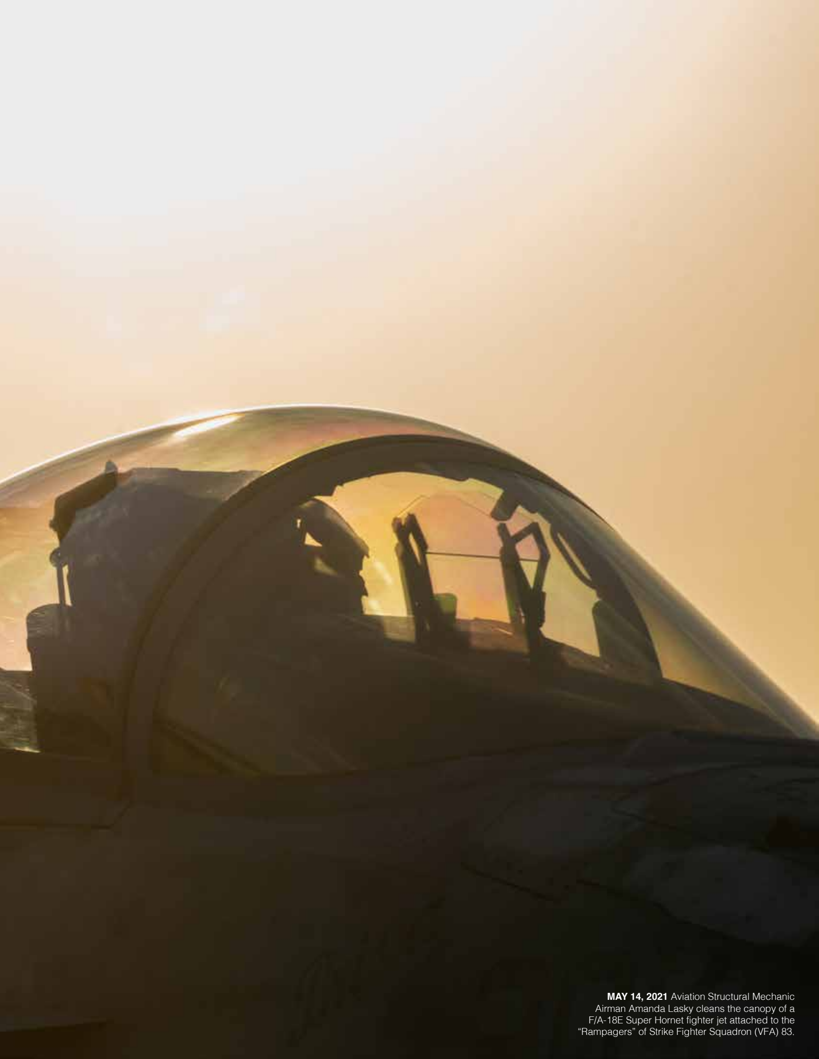
MAY 14, 2021 Aviation Structural Mechanic Airman Amanda Lasky cleans the canopy of a F/A-18E Super Hornet fighter jet attached to the "Rampagers" of Strike Fighter Squadron (VFA) 83.