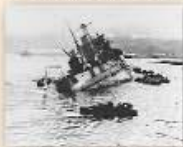
USS Utah (AG 16)