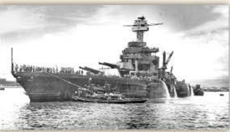
USS West Virginia (BB 48) Approaching drydock at Pearl Harbor Navy Yard June 8, 1942, just over six months after she was sunk in the Japanese air raid on Pearl Harbor.

Number of U.S. Navy Ships Sunk, Raised, Repaired...and Present at Tokyo Bay During Japan's Formal Surrender Sept. 2, 1945