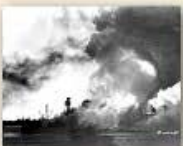
USS Arizona (BB 39)