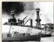
USS Oklahoma (BB 37)