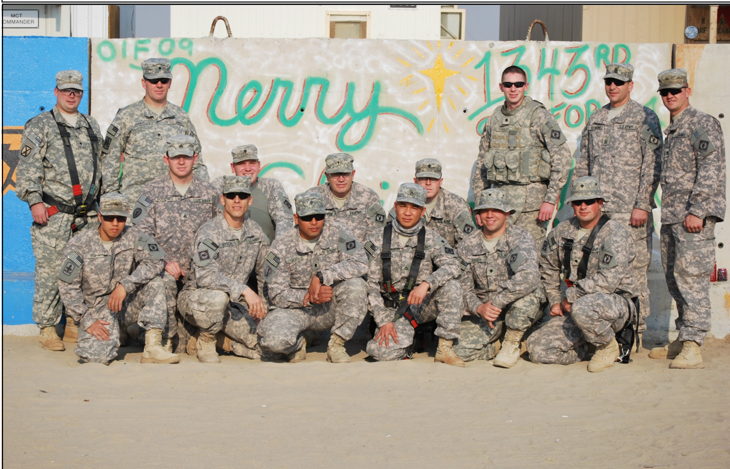
KUWAIT-IRAQ BORDER — Soldiers with Headquarters and Headquarters Battery, 2-300th Field Artillery, pose for a picture in front of a barricade wishing all a Merry Christmas. The Soldiers were at the border preparing for a Christmas Day mission into Iraq.