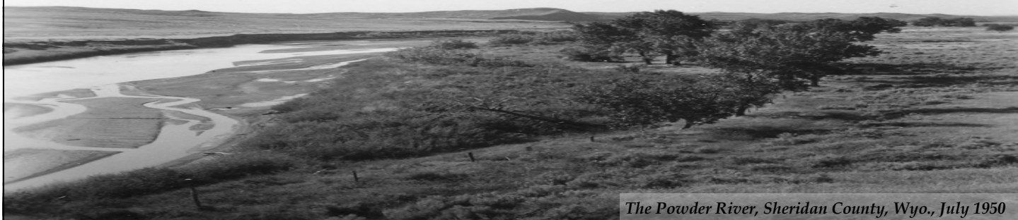
The Powder River, Sheridan County, Wyo., July 1950