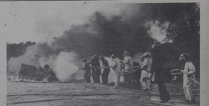
SIMULATED CRASH FIRE — Volunteer firemen from Onslow and Carteret Counties extinguish a simulated automobile crash fire during training exercises held recently at Camp Lejeune and sponsored by Coastal Carolina Community College. Training included the use of fire extinguishers, proper handling of fire hoses, ladder climbing and the proper method of locating and extinguishing a fire in a smoke filled building.