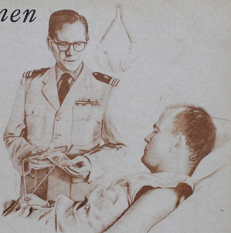
...making a hospital visit, the chaplains are there to help.

"Whether it is aboard ship, on a hospital ward, in a base chapel, in the field with Marines, or in a dependents daily vacation Bible school, Navy chaplains continue to reach out as God's witnesses with prophetic messages as well as with helping hands and understanding hearts to inspire, encourage, comfort and support."