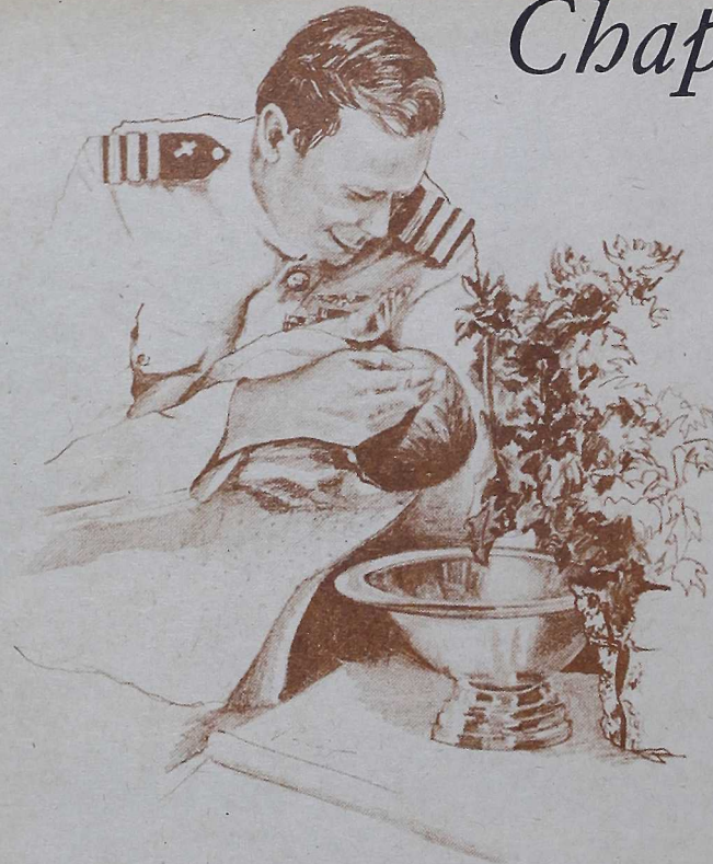
Whether it's baptizing an infant . . .

Navy chaplains will observe the 197th anniversary of their corps Tuesday. Some 900 clergymen, representing 54 denominations, serve in today's Navy chaplaincy at Navy, Marine Corps and Coast Guard installations and aboard hundreds of ships.