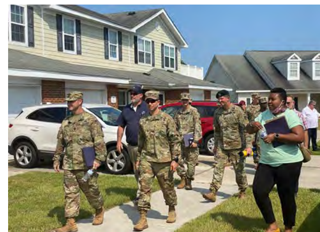
Hunter Army Airfield leadership, along with Balfour Beatty Communities, tour the New Gannam housing area during a walking town hall, July 30.