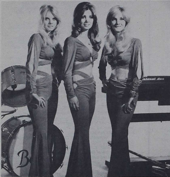
COMING UP—The Country Belles will be appearing at the COM on Feb. 19 from 8 p.m. to midnight for your dancing and listening pleasure.