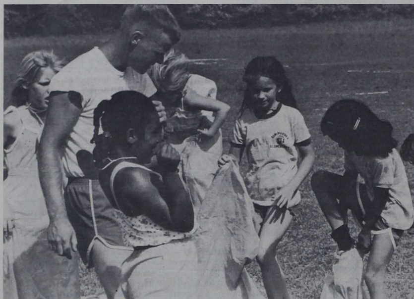
CAN'T GET MY FOOT OUT — A fourth grader at Summersill Elementary School has trouble getting her foot out of a potato sack as one of the Hotel Battery, Third Battalion, Tenth Marine volunteers readies to help her. Hotel, 3/10 volunteers helped score, judge and referee Summersill's 2nd Annual Fun Day held June 6.