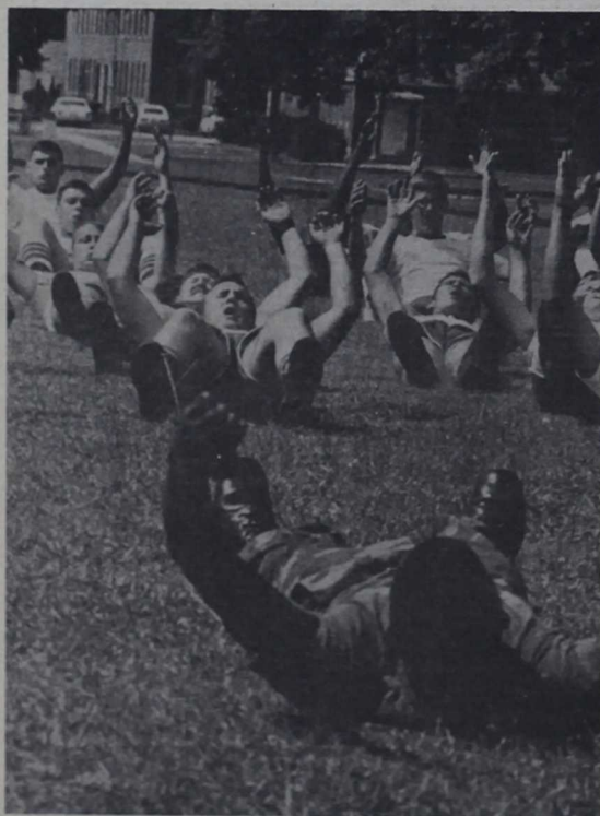
AGONIZING ACHES — A group of Marines perform the exercise referred to as rowing. As these men move up and down their stomach muscles tighten and the pain of suffering shows in their faces.

"Men, take a shower and get cleaned up. We've got a full day of work ahead," said the Gunny, tired, but proud - of his men... of his Corps.