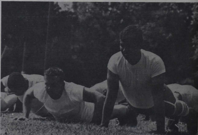
DOES HE REALLY KNOW? — A group of Marines struggle their way through a set of push-ups during warm-up exercises for their six-mile run.