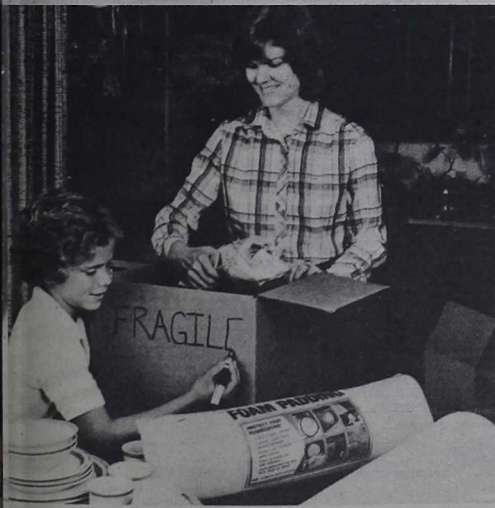
NICE AND EASY — Packing your belongings for an upcoming move shouldn't be taken lightly. When you "Do-It-Yourself," the move can be done at your pace. For more information on Do-It-Yourself moves contact the Household Goods Office (Bldg. 1011) here.

This weekend's specials include electric briskers; AM/FM stereo cassettes; one brand of shaving cream in 11 ounce size; one brand of candy in one pound boxes; one brand of lemonade by the six-pack; one brand of spaghetti & meatballs in seven and one-half ounce cans; one brand of sausage pizza mix in one pound-seven ounce size; self-propelled 22 inch lawnmowers and in-place jogging machines.