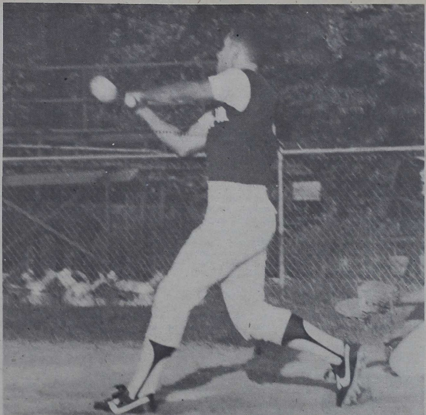
SSSSSSSMACK — A Support Battalion softballer puts some "wood" on the ball during their 7-6 victory Monday night over Rifle Range. The Range came on strong in the last inning with a rally, but Support hung on to the lead, the game, and their first place standing in Base Intramural Softball.