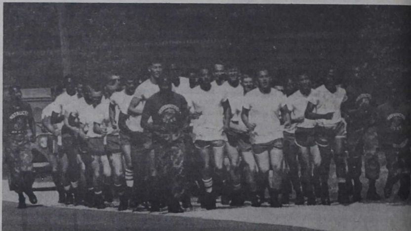
SIX-MILE SHUFFLE — A group of Marines from 2nd Marine Division NCO School run down the road working on staying in step and developing a sense of unit pride. After the six-mile run these Marines breathe a breath of relief.

A burly Marine falls out to the side and begins singing "If I die on the Russian front." The company echoes his song, as a sense of pride