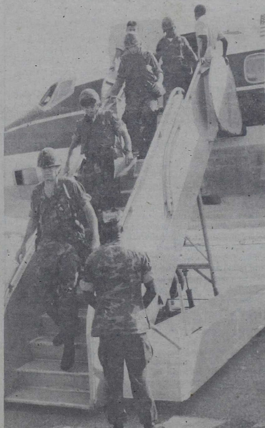
HOME AT LAST — Marines from 1st Battalion, Eighth Marine Regiment arrive at Marine Corps Air Station, Cherry Point, N.C. after spending four weeks at Key West, Fla. The Marines participated in a humanitarian operation to help Cuban refugees arrive in the U.S. Marines from 1st Battalion, Sixth Marine Regiment have replaced 1/8 Marines.