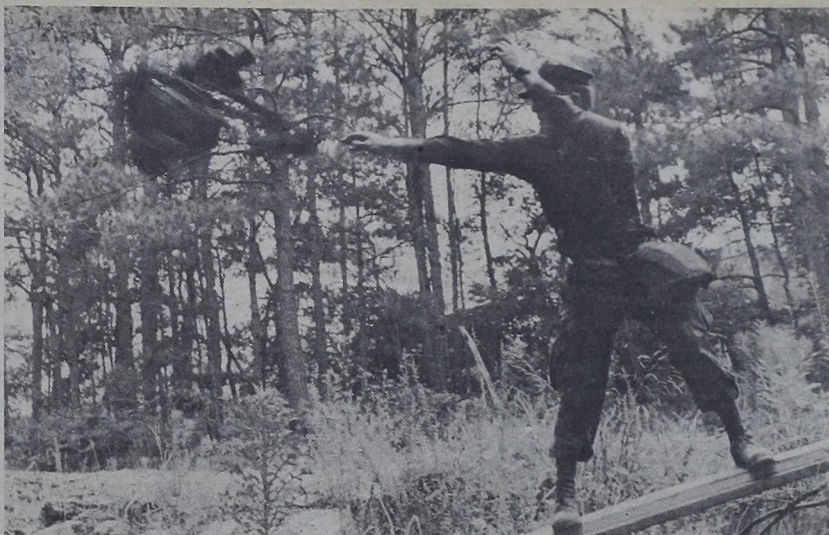
HEAVE NO — A "Charlie Company," 2nd Reconnaissance Battalion, Marine throws his pack across a ravine prior to trying to make a bridge out of three boards. This was one of many obstacles these Marines faced during a new idea in training methods.

Each face, however tired, reflected an attitude of business as usual - as each Marine realized what he had achieved was part of the "Recon" legacy.