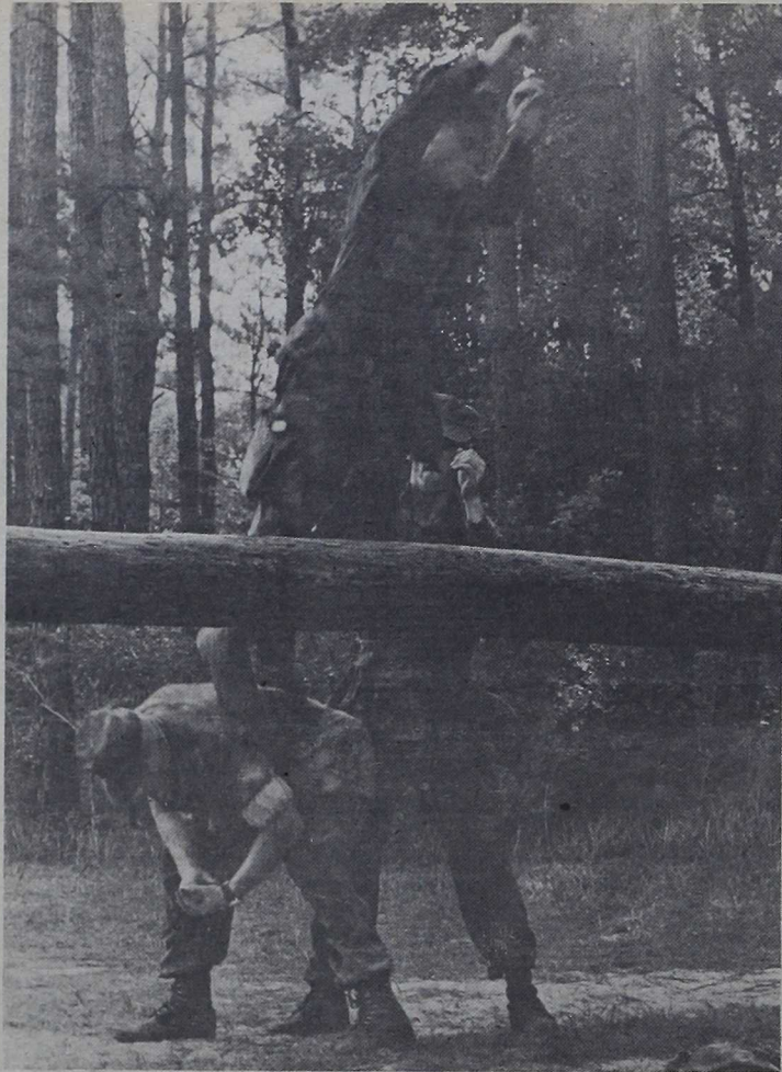
ESCAPE — Having to get over a booby-trapped wall of a mock prisoner-of-war camp without touching the wall proved to be no problem for the Marines of 2nd Reconnaissance Battalion, 2nd Marine Division here. Using teamwork and each other, the Marines were able to escape confinement, and accomplish their goal.