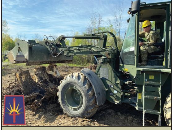
An engineer assigned to the 152nd Engineer Support Company clears tree trunks and debris during construction operations at the Youngstown Local Training Area May 15, 2021. The company returned to the field for training after a year of virtual training, constructing space for the Army Combat Fitness Test, Situational Training Exercise lanes and land navigation.