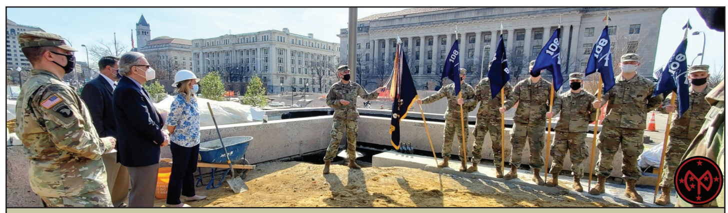
Soldiers of the 2nd Battalion, 108th Infantry Regiment in formation at the National World War I Memorial in Washington, D.C. while holding the colors and guidons of the battalion, during a ceremony memorializing the battalion's World War I service on March 9, 2021.