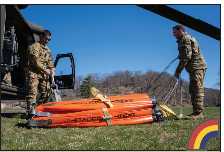
Above right, aircrews from the 3rd Battalion, 142nd Aviation Regiment, conduct water bucket training at Camp Smith Training Site April 6, 2021. Above left, crews train alongside New York State Forest Rangers to improve wildfire fighting techniques in Latham, N.Y., May 6, 2021.