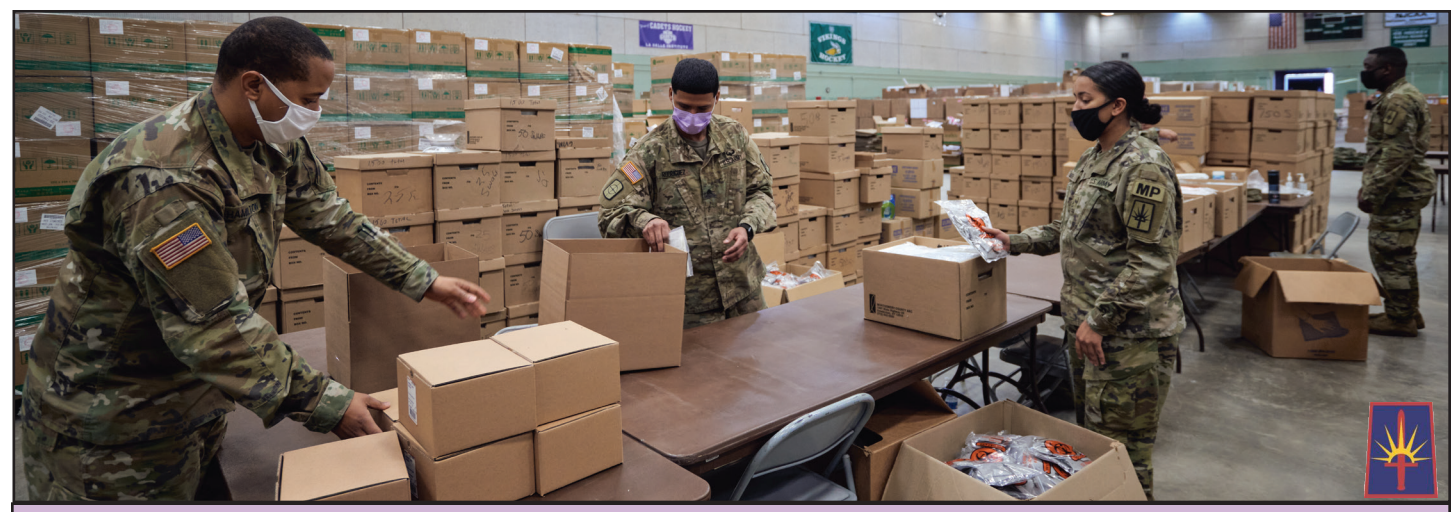
Soldiers of the New York National Guard assemble COVID-19 test kits to be shipped across New York State from Hudson Valley Community College, Troy, N.Y., April 13, 2021.