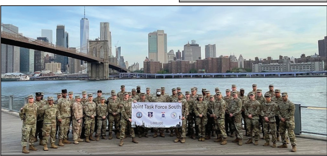
New York State Military Forces Service members assigned to JTF South mark one million vaccines administered throughout the JTF South area of operations in front of the Manhattan Skyline on June 1st, 2021. JTF South encompasses NYC, Long Island and Westchester County area. Over 3,180 members of the New York Military Forces are supporting the multi-agency response to COVID-19 in the JTF.