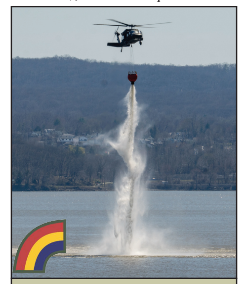
3rd Battalion, 142nd Aviation Regiment aircrews conduct water bucket training at Camp Smith and over the Hudson River, April 6, 2021.