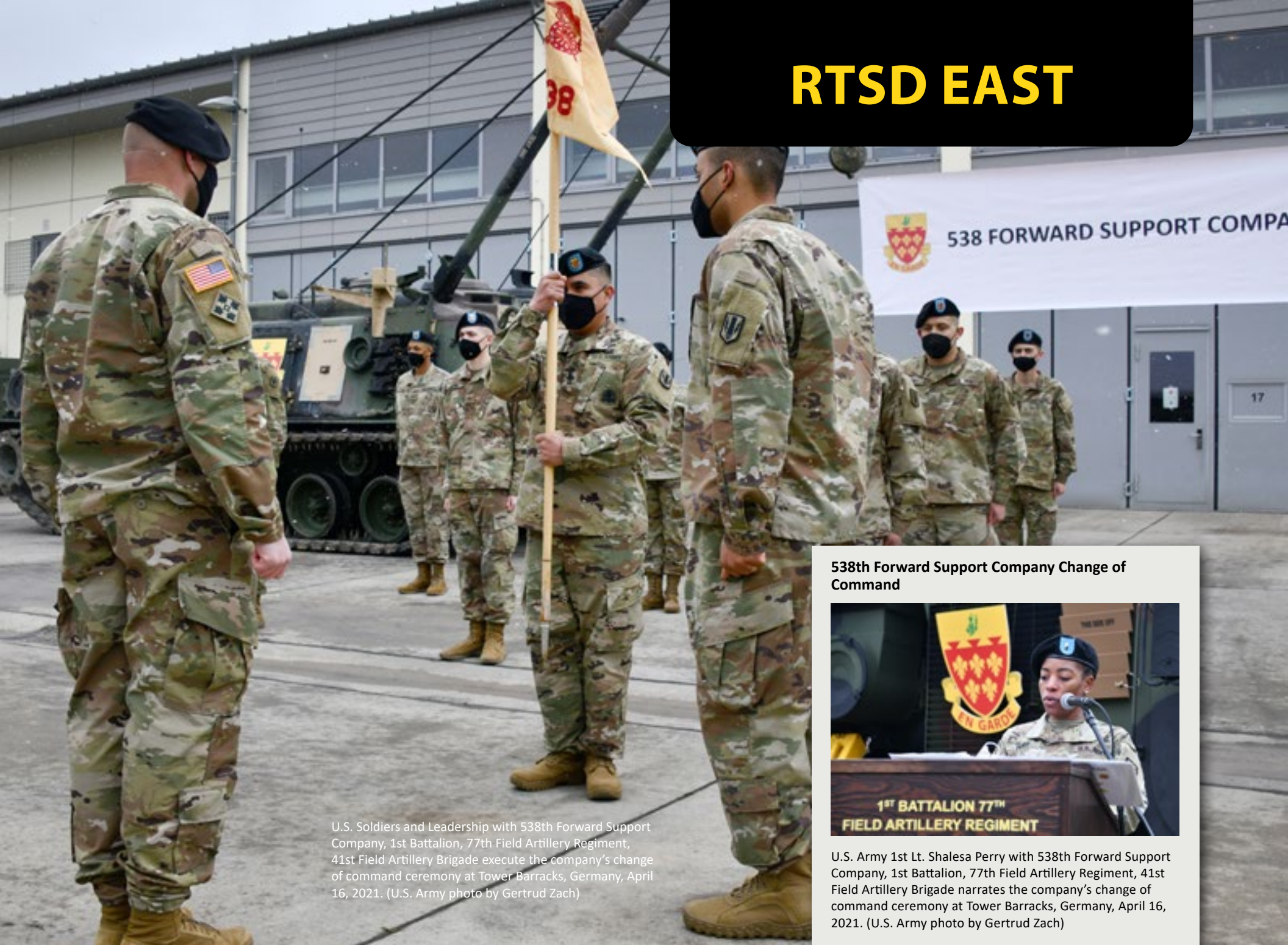
U.S. Soldiers and Leadership with 538th Forward Support Company, 1st Battalion, 77th Field Artillery Regiment, 41st Field Artillery Brigade execute the company's change of command ceremony at Tower Barracks, Germany, April 16, 2021.