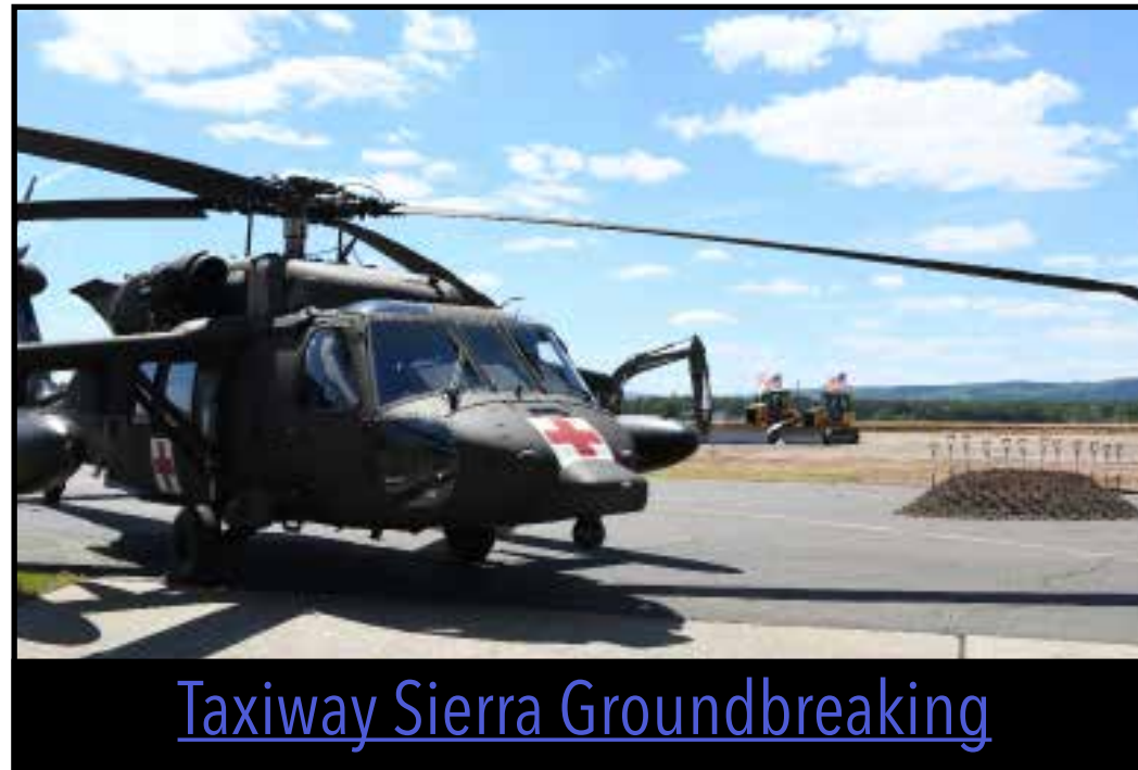
Taxiway Sierra Groundbreaking

View all Command Media, news, Air Scoops and more on the Air Force Connect Mobile App. Add the 104th Fighter Wing to your favorites. Available on the Apple App Store and Google Play Store