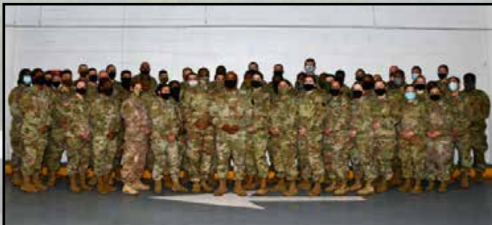
NGB SEA Whitehead Visits MA Troops in DC