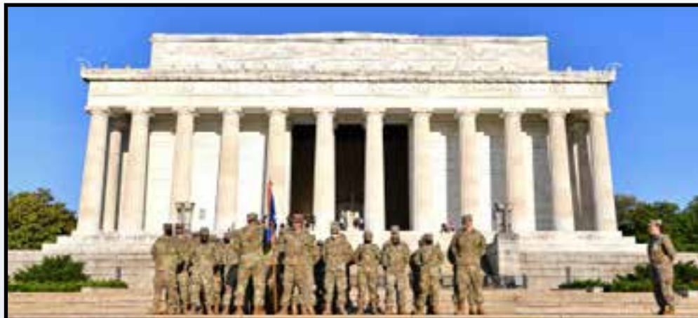
Reenlistment Ceremony at Lincoln Monument