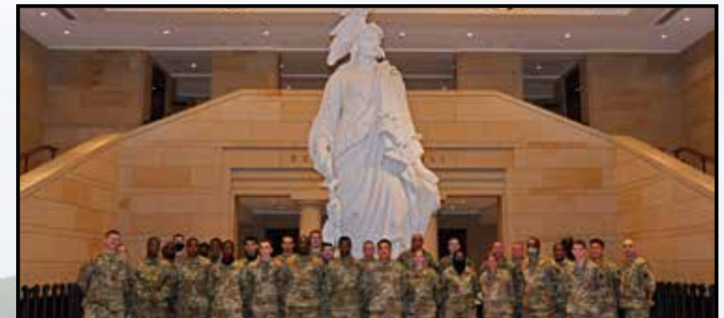
Combined Award, Promotion Ceremony