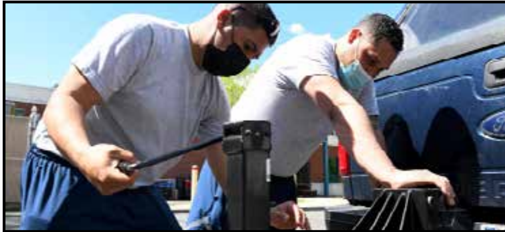
Fatality Search and Recovery Team Training