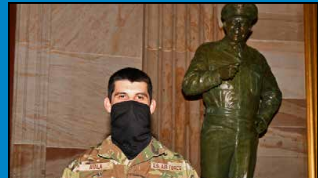
Avionics Airman on Mission in DC