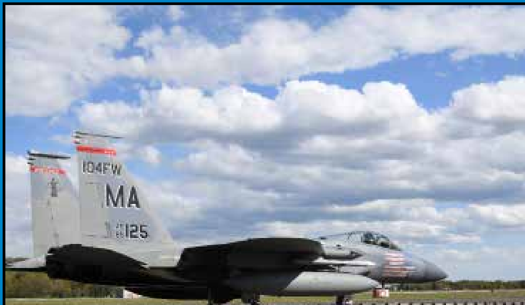
125 Hits 10,000 Hours