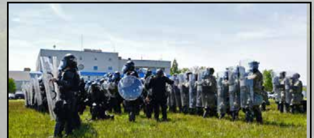
Civil Disturbance Training in DC