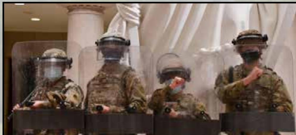
Mass Guard on Mission in DC