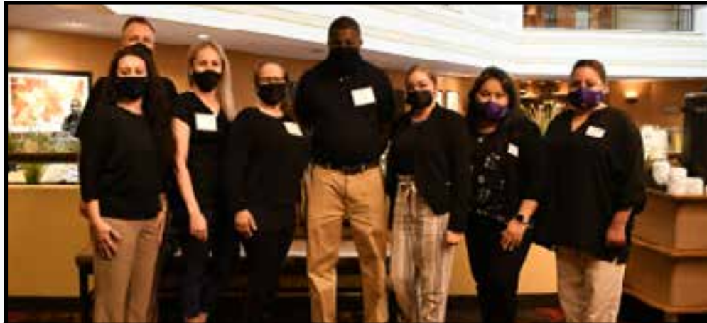
Yellow Ribbon Event