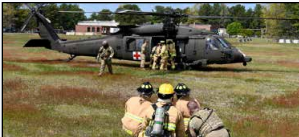
Incident Response Training