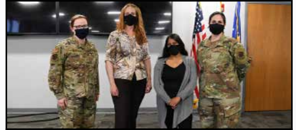
It is ok not to be ok