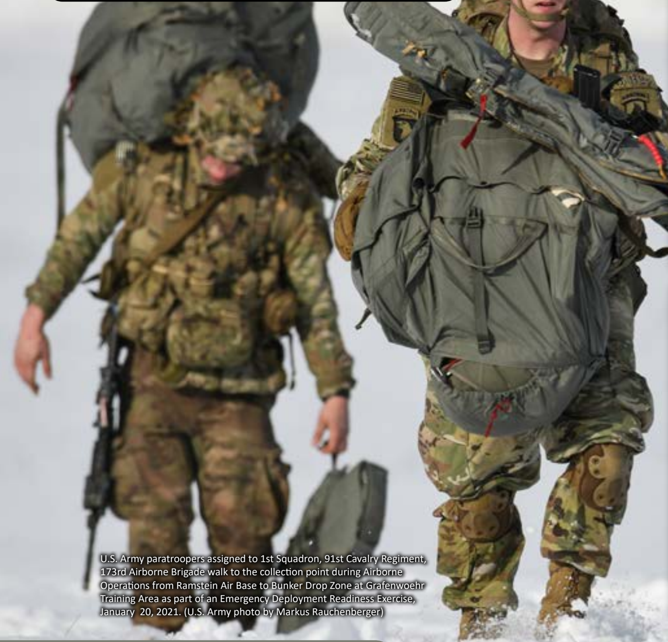
U.S. Army paratroopers assigned to 1st Squadron, 91st Cavalry Regiment, 173rd Airborne Brigade walk to the collection point during Airborne Operations from Ramstein Air Base to Bunker Drop Zone at Grafenwoehr Training Area as part of an Emergency Deployment Readiness Exercise, January 20, 2021.