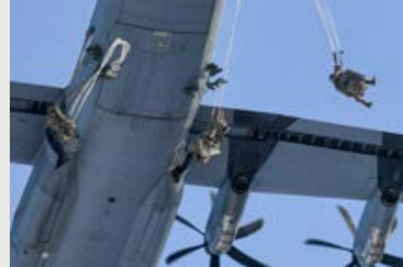
U.S. Army paratroopers assigned to 1st Squadron, 91st Cavalry Regiment, 173rd Airborne Brigade perform Airborne Operations from Ramstein Air Base to Bunker Drop Zone at Grafenwoehr Training Area as part of an Emergency Deployment Readiness Exercise, January 20, 2021.