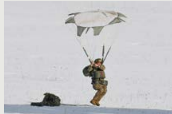
A U.S. Army paratrooper assigned to 1st Squadron, 91st Cavalry Regiment, 173rd Airborne Brigade prepares to land during Airborne Operations from Ramstein Air Base to Bunker Drop Zone at Grafenwoehr Training Area as part of an Emergency Deployment Readiness Exercise, January 20, 2021.