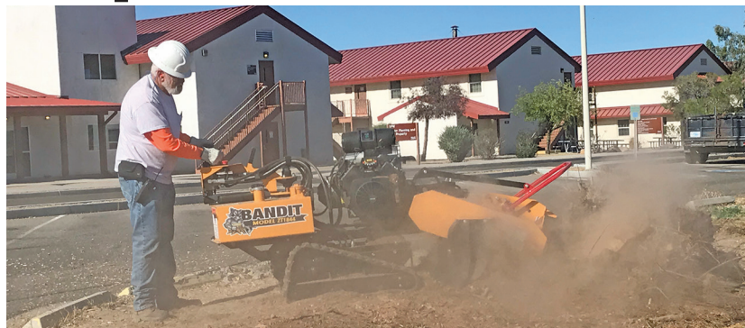
Don Parks used a stump grinder for the removal of salt seeder stumps. The stumps were not only an eye sore but also a place for spiders, snakes, and other venomous critters to hide.

Shearwater / EMI Services’ team is responsible for maintenance and repair of facilities and infrastructure of almost all of Yuma Proving Ground (YPG) and Yuma Test Center aside from the housing area. All 14 acres of Cox Field and other grassy and zeroscape areas around the installation require some type of maintenance, throughout the year. With YPG being nearly the size of Rhode Island, the job is a huge undertaking.