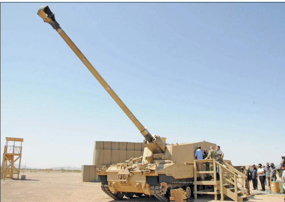
The Extended Range Cannon Artillery autoloader's speed was demonstrated during a test March 30 at U.S. Army Yuma Proving Ground.