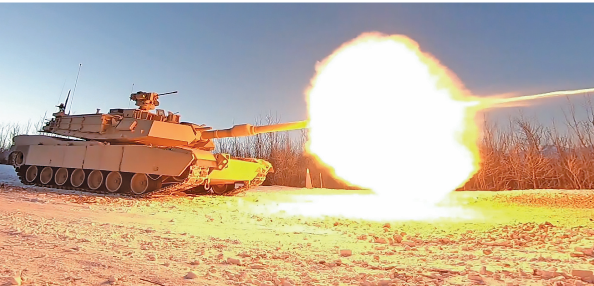
Improvements under test included: improved fire control electronics; the armor and onboard diagnostics.