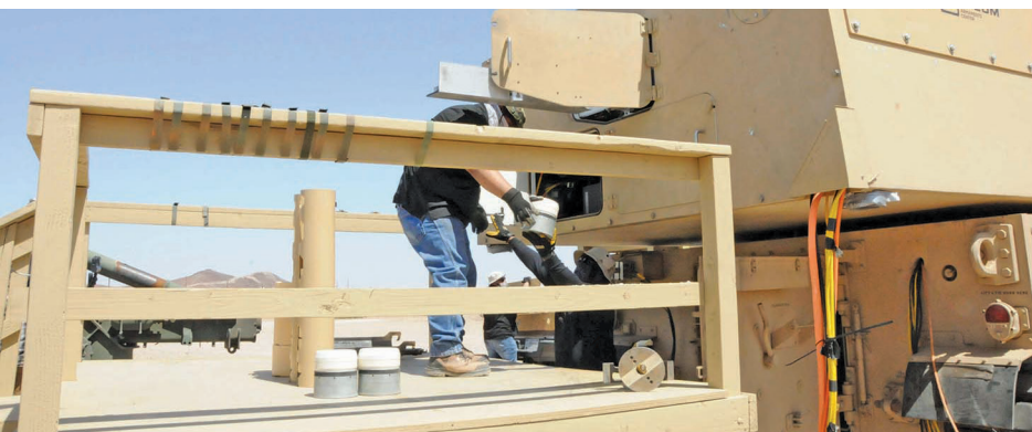
The demonstration involved the 31-round full-capacity autoloader using different types of charges, and the goal was to obtain data on how to increase the rate-of-fire.

"We are on the right path. The combination of the propellant magazine, the projectile magazine, and the transfer mechanism is really magical to see in action. It's an early effort that is going to mature into a 23-round system that is going to be demonstrated late this year," said Rafferty.