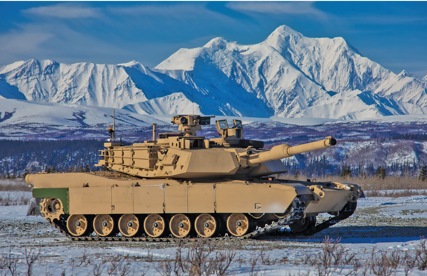
The M1 and its variants have been tested at U.S. Army Yuma Proving Ground and its constituent test centers for more than 40 years.

Though the platform was extensively tested at Yuma Test Center prior to being put through its paces in Alaska, the sub-zero temperatures brought forth glitches that would have been unimaginable in the desert.