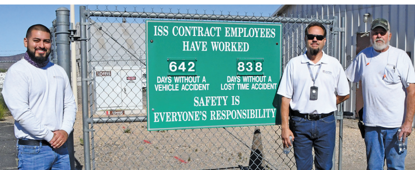
As of the printing of this article, Shearwater / EMI Services Team had more than 600 days without a vehicle accident and more than 800 days without an accident resulting in loss of work time.

The YPG community will also notice another crew on-site laying all the conduit to replace copper lines with fiber on the Howard Cantonment Area.