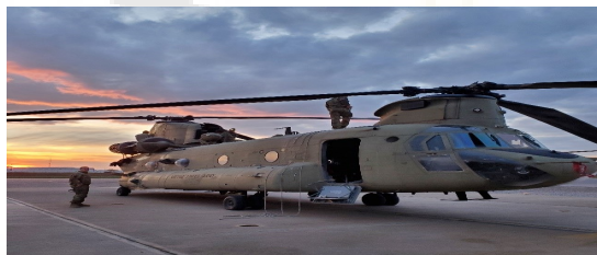
Routine check on a Chinook