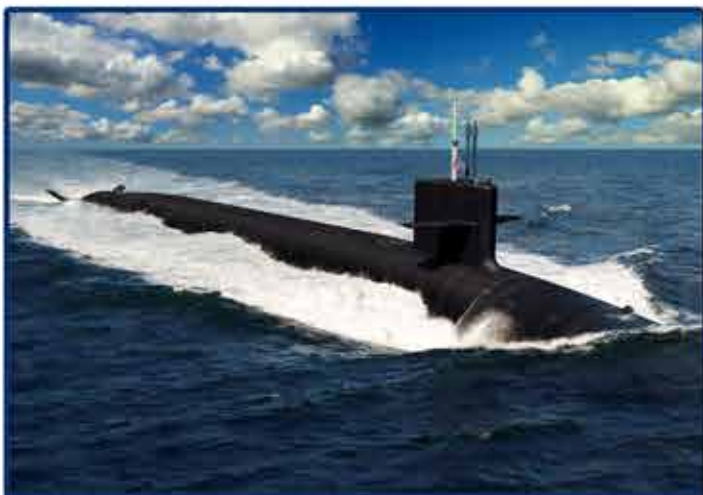
The VC-25B Presidential Aircraft Recapitalization, the B-2 Defensive Management System — Modernization, and the SSBN 826 Columbia Class Submarine Program are all major defense programs that DCMA’s global network of acquisition professionals work within. The agency’s team members enhance warfighter lethality by ensuring timely delivery of quality products, and providing relevant acquisition insight to support affordability and readiness.