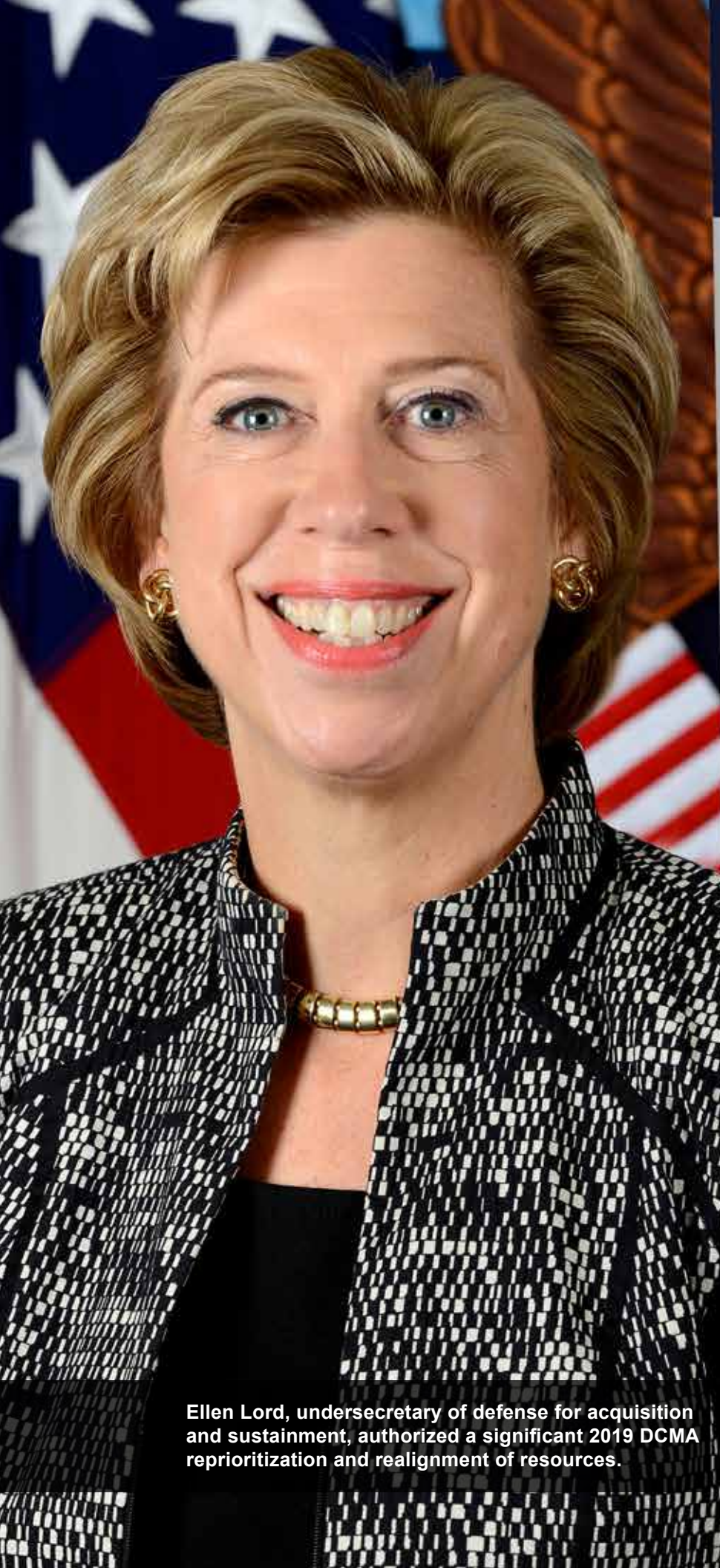
Ellen Lord, undersecretary of defense for acquisition and sustainment, authorized a significant 2019 DCMA reprioritization and realignment of resources.