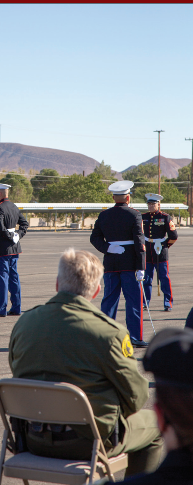
stant, reads the traditional birthday during the Marine Corps 245 birthday aboard Marine Corps Logistics Base