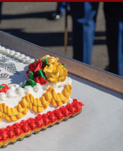
ps Birthday cake cutting ceremony displays blem aboard Marine Corps Logistics Base e Route 66, the one mile section that runs that is not accessible to the public, making