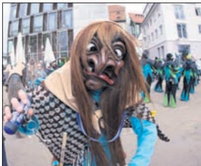
Scary fools in carved wood masks spook people along the Sindelfingen parade route.