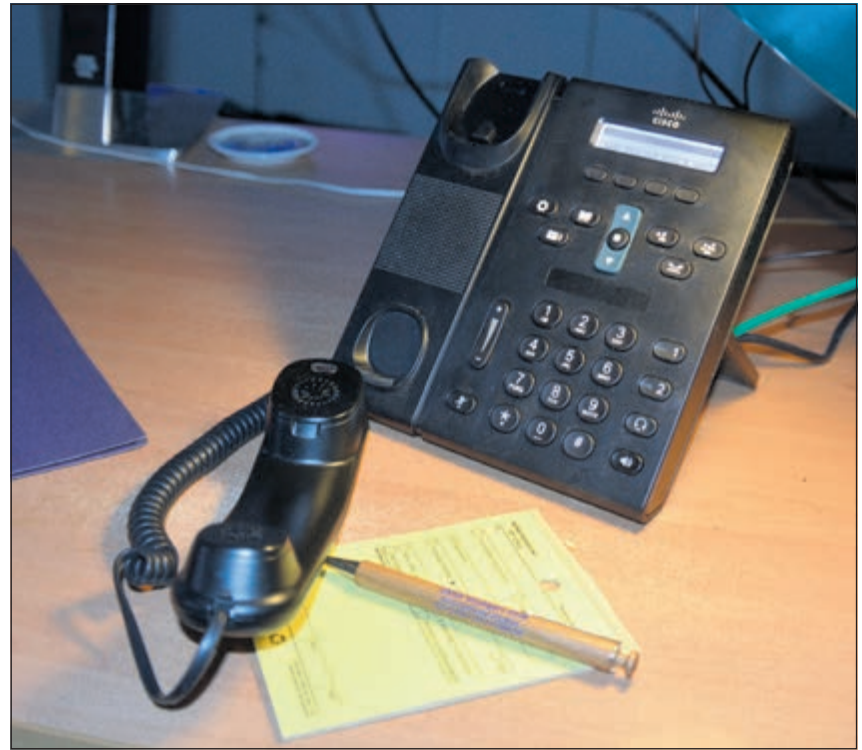
An example of one of the VOIP phones now being used by the garrison.

swapped out for the Directorate of Public Works, which chose a different model VOIP phone than the other directorates. The government's security features must be met before switching from landlines. Regardless of phone model,