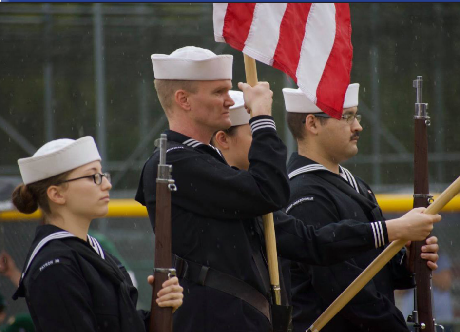
Sailors from Naval Air Station Jacksonville perform Color Guard duties at the opening ceremonies of the Navy-Ortega-Lakeshore Little League Spring season at the baseball diamond on NAS Jax, March 2.