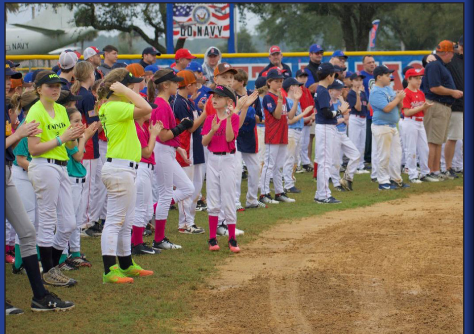
Members of the Navy-Ortega-Lakeshore Little League team assemble on the field during the opening ceremonies of their spring season at the baseball diamond on Naval Air Station Jacksonville, March 2.